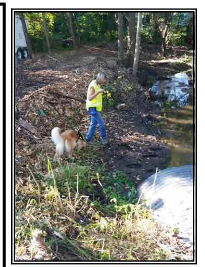
E. coli source tracking investigation at Davis Creek.