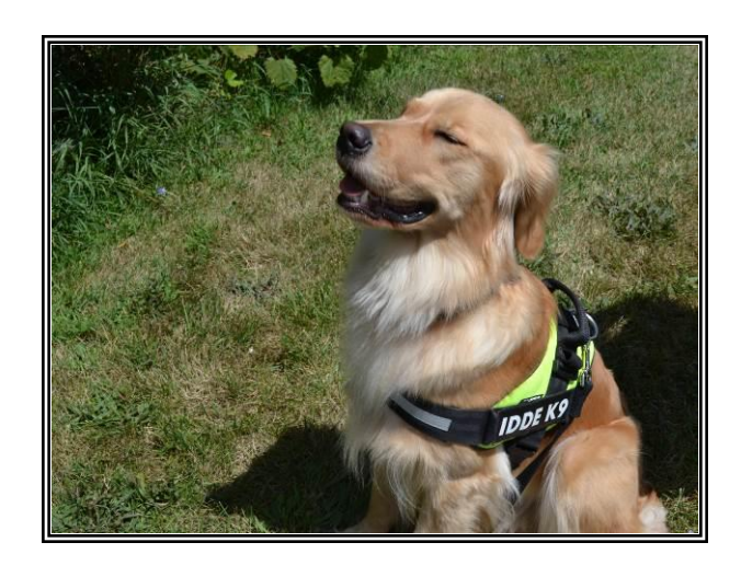
Kenna the canine would sit to alert her handler when she detected human sewage in the stream or in streamside seeps and inflows. She gave a positive alert at 22 of 37 sites that were tested from Davis Creek.

Kenna the canine working with Environmental Canine Services, LLC to investigate potential human sources of E. coli to Davis Creek, a Kalamazoo River tributary. Sources are often inconspicuous seeps or pipe inflows that drain areas with leaking septic or sewer systems.