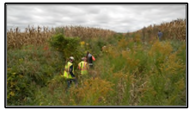
Stream walk assessment participants, October 2015