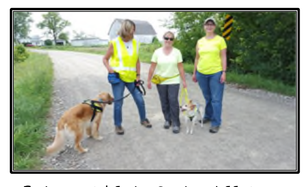
Environmental Canine Services, LCC stream survey, August 2015