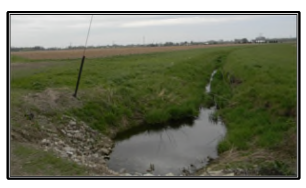
Example of riparian buffer at North Branch Wenrick & Cousino Drain, May 2014