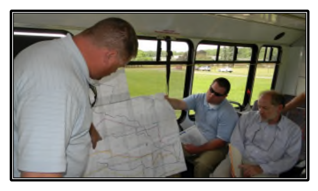
SS Lapointe Drain Watershed tour, June 2014