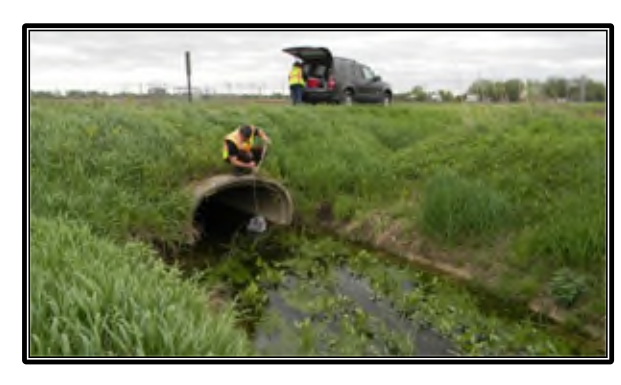
Water quality sampling activities, May 2015