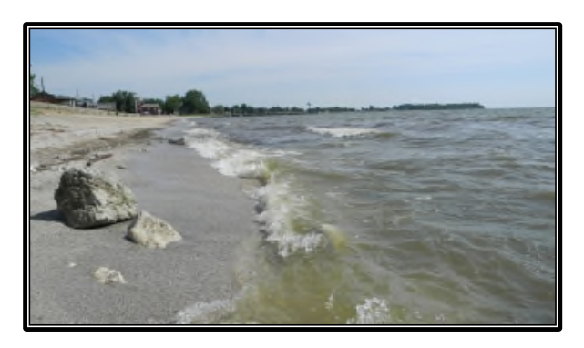
Luna Pier Beach, June 2015