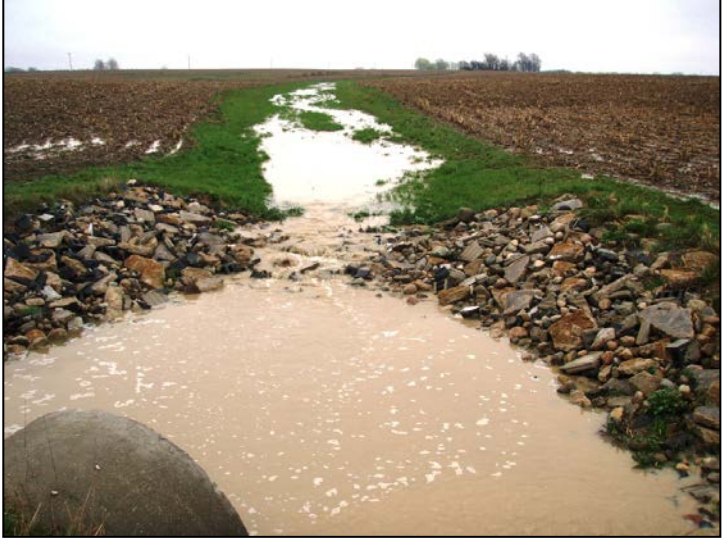
Picture taken during agricultural inventory of critical subwatersheds

Compilation of the new research that was funded by the grant to develop the watershed management plan