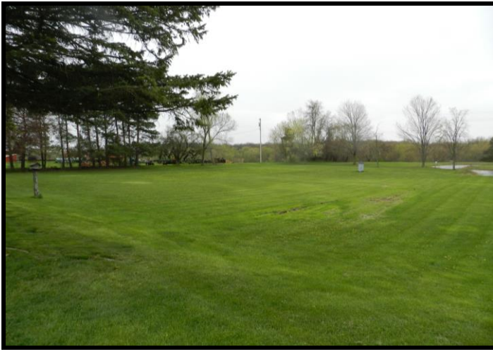
BEFORE: Failing septic system drain field