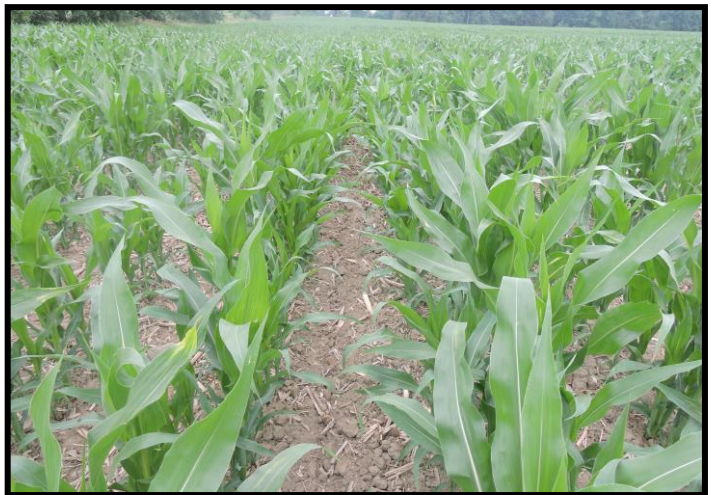
No-till cornfield with manure injection