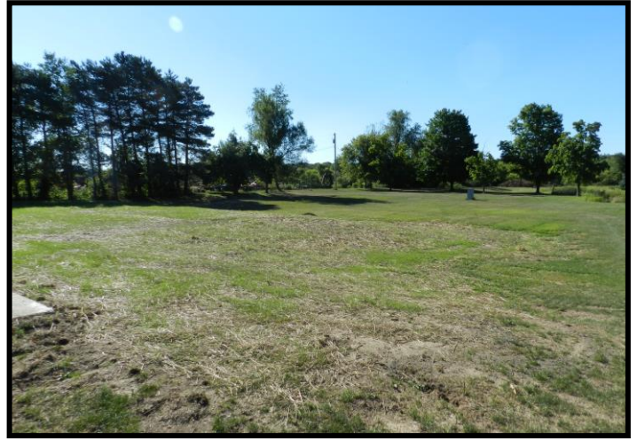
AFTER: Newly installed "mound" septic system