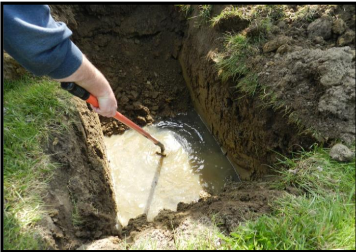
BEFORE: Soil pit showing failing septic drain field