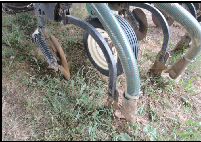
Manure fertilizer injected into no-till field