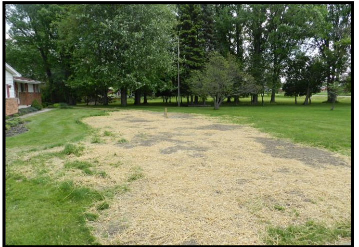
AFTER: "Mound" septic system installed replacing failing system