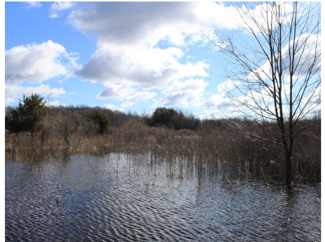
Sora Meadows Restoration, After: 6.4 acres of wetland were restored on this site and an additional 2.25 acres were restored on a neighboring property (with funding through the US Fish and Wildlife Service).