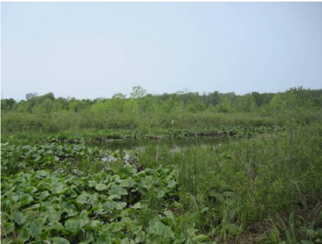
Camp Ronora Conservation Easement: Protects 210 acres and a variety of habitats, including fen, scrub-shrub wetland, forested wetland, emergent wetland, lake shoreline and forested uplands.