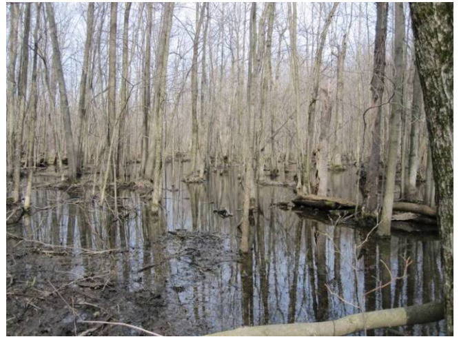
Eureka! Conservation Easement: Protects 341 acres of some of the highest quality floodplain forest in Southwest Michigan, as well as a 2.2 mile stretch of the Paw Paw River and frontage on several drains and ponds.