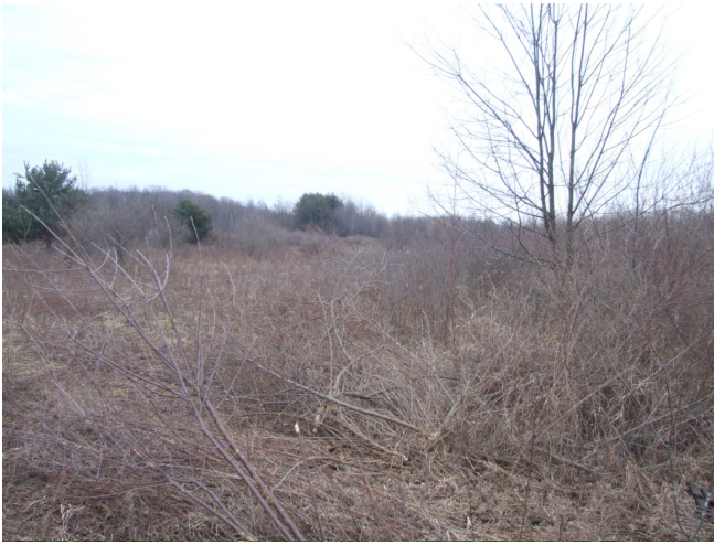
Sora Meadows Restoration, Before: This 60-acre property was donated to the Southwest Michigan Land Conservancy. The property was a mixture of existing wetland and fallow farm fields, with significant potential wetland restoration area.