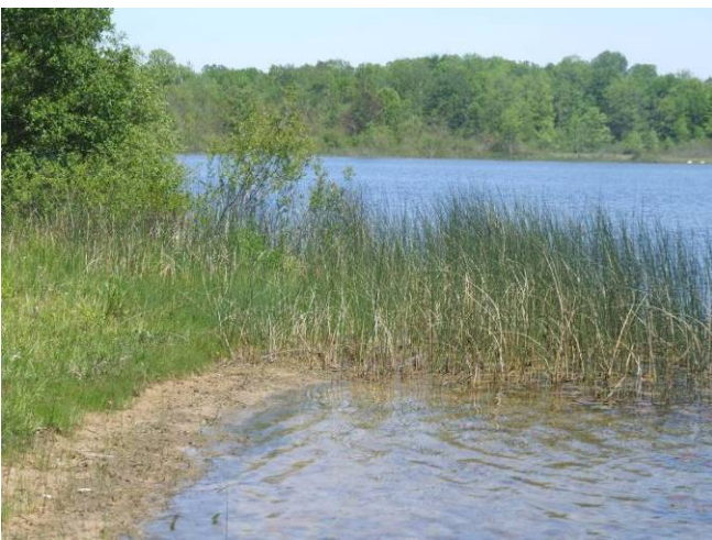
Hering Conservation Easement: Protects 16 acres and 1,000 feet of shoreline on Lower Jephtha Lake; adjacent to a 49-acre nature preserve.