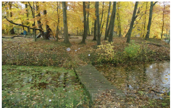
Heuser Conservation Easement: Protects 71.5 acres of wetlands, forested uplands, natural shoreline and 2,600 feet of frontage along the Shafer Lake Outlet.