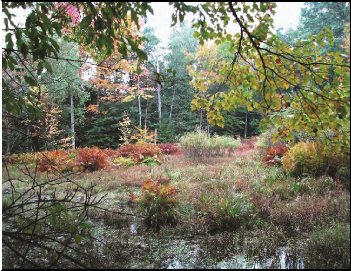
“The Land” conservation easement was protected in late 2016 and is the largest contiguous conservation easement held by the Land Conservancy at 651 acres. The Oceana County property includes forested and emergent wetlands that serves as the headwaters of Ruby Creek, a high quality tributary to the Big South Branch of the Pere Marquette River.