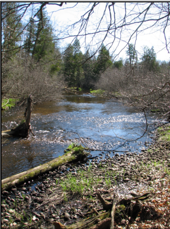
Cedar Creek, at Jenkins Property is another high quality waterway surrounded by cedar wetlands just before flowing into the Big South Branch.