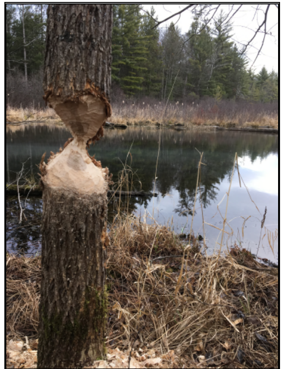
The Land Conservancy was able to work with four contiguous landowners at the Middle Branch of the Pere Marquette River, a new approach using funds provided by this project.