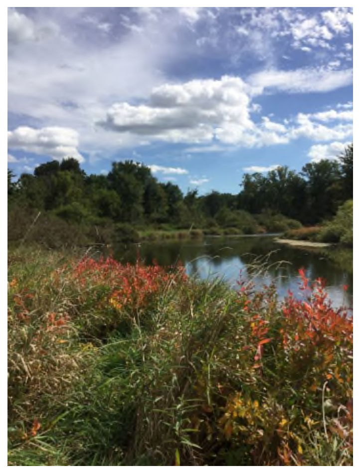
Coppa: Permanent Conservation Easement