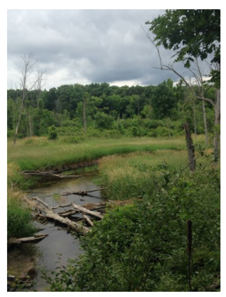
Toma: Permanent Conservation Easement