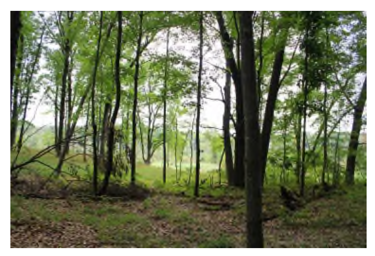
Thomas: Permanent Conservation Easement