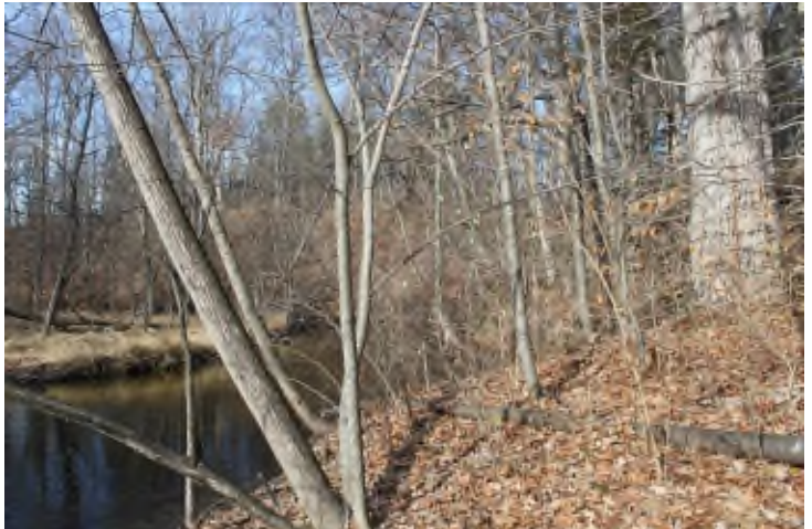
Nester: Permanent Conservation Easement