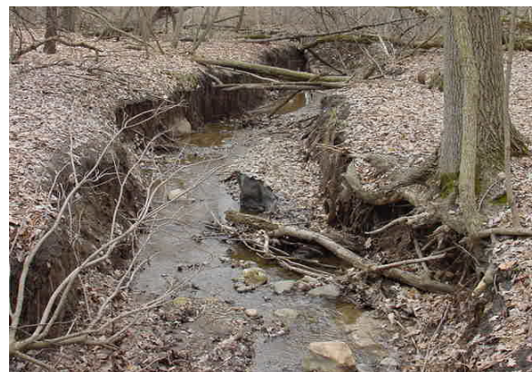
Figure 2: An unstable stream

Figure 2 illustrates an unstable stream with extensive streambank erosion, caused by increases in the peak flows and volumes. A thorough assessment of the causes of the erosion is often necessary so that the proposed solutions will be permanent and do not simply move the erosion problem to another location. A comprehensive watershed study, incorporating hydrologic modeling, was conducted by the Hydrologic Studies Unit, LWMD, MDEQ for the Blakeslee Creek site shown in Figure 2 to help select the most appropriate rehabilitation techniques.