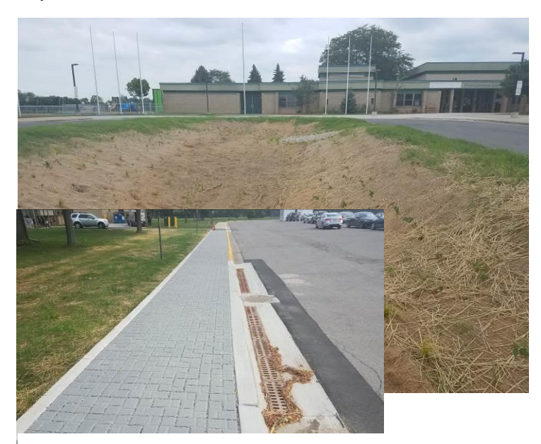
Mitchell School After: Large bioinfiltration cell to capture parking/roof runoff. Porous sidewalk gravel bed storage and drain to capture parking runoff.