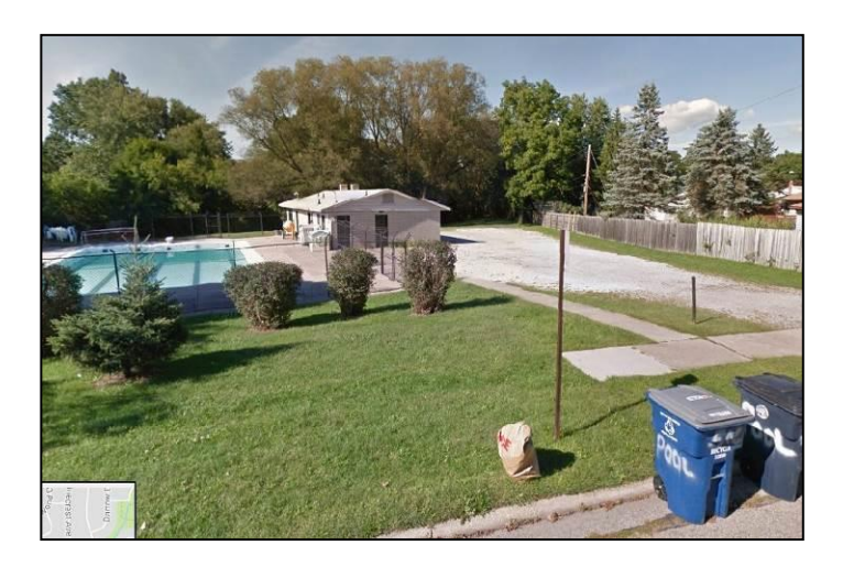
Forestbrooke Before: no stormwater treatment, aging infrastructure, road runoff onto property, direct connection to Swift Run behind pool.