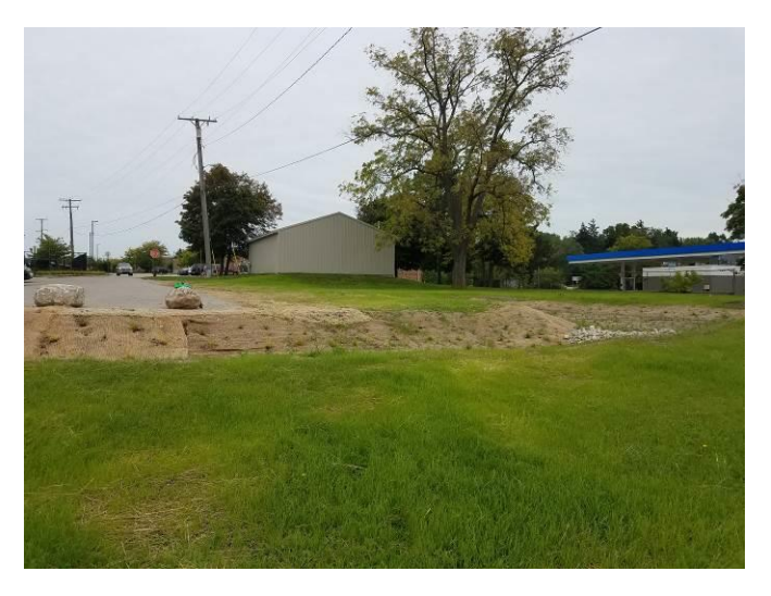
Hogback After: 3-cell bioinfiltration to capture parking/roof runoff.