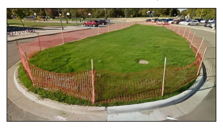
Mitchell School Before: Large parking and roof areas generating runoff. Poorly utilized green spaces.