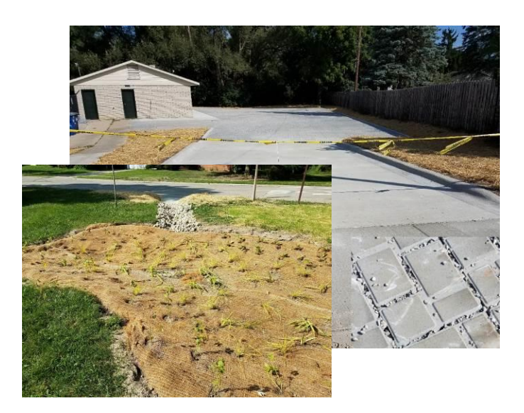
Forestbrooke After: Parking replaced with porous pavers and underground stone basin. 4 bioinfiltration cells receive street and roof runoff.