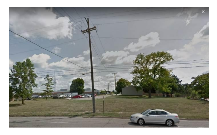
Hogback Before: Large parking and roof areas generating runoff to street. Poorly utilized green spaces.