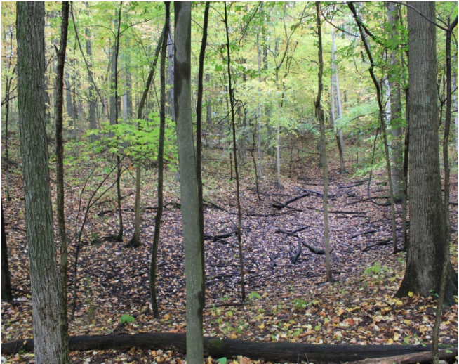
Thompson Conservation Easement