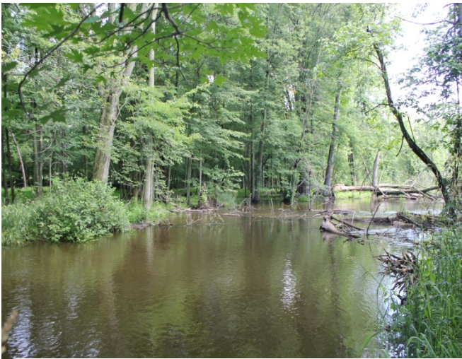
Van der Schalie Conservation Easement