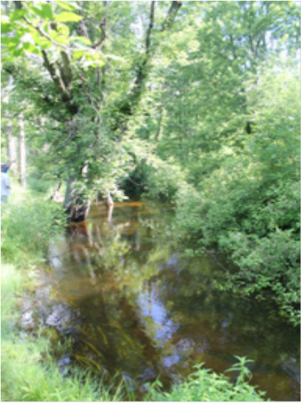
Trachet Conservation Easement