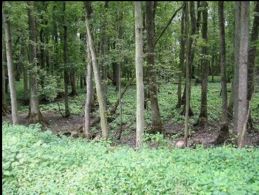
Typical Forested Wetland in Summer