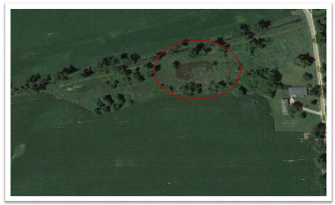
Figure 3. Before (top-8/5/2009) and after (bottom-7/15/2015) the capacity of a streamside wetland was increased.