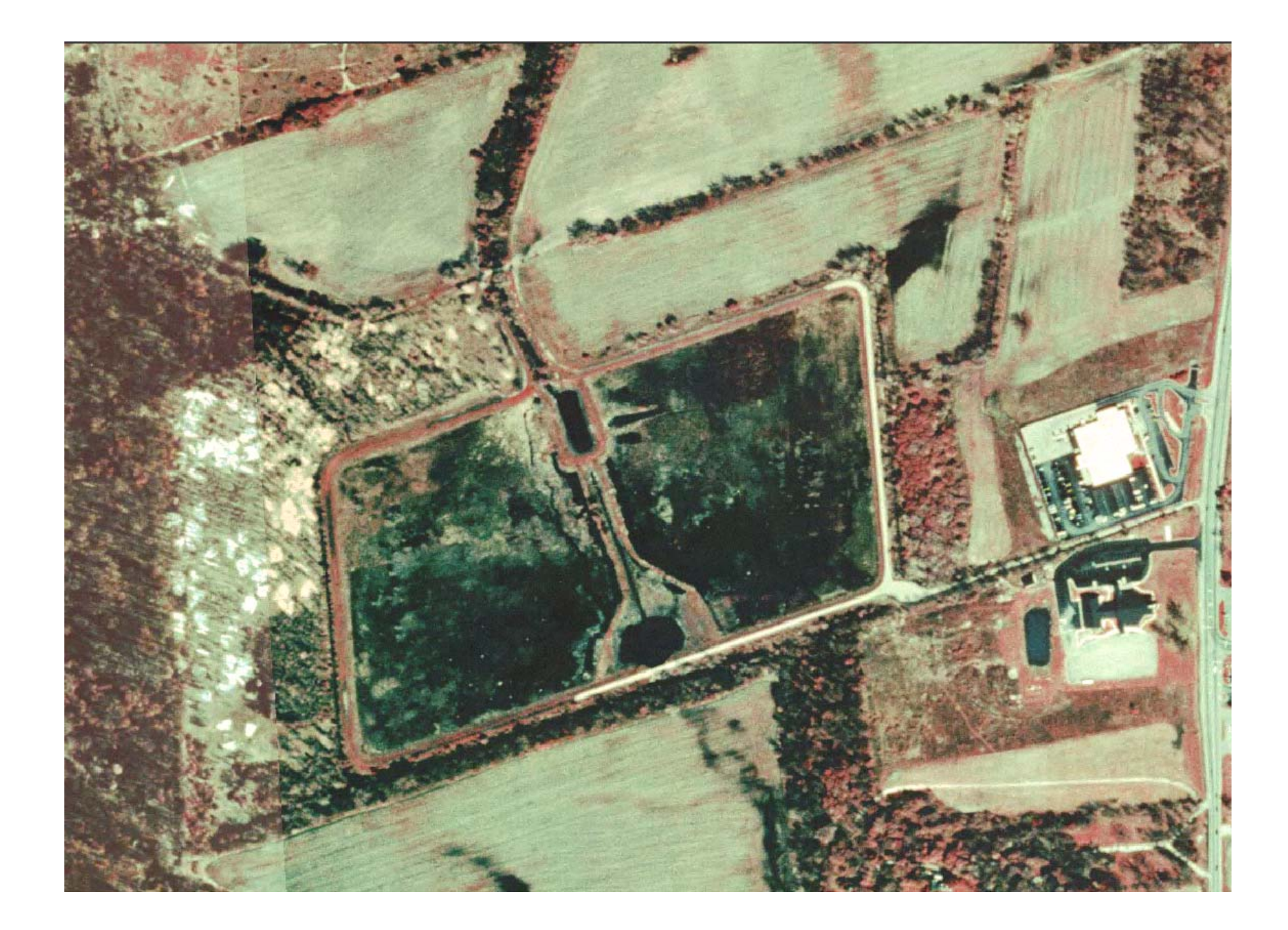
Figure 2. Paint Creek 44 acre detention basin with forebay and micropool (1/2 inch \cong 200 feet).