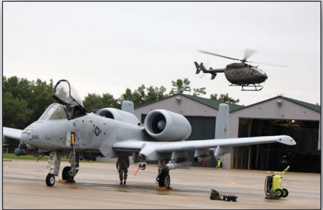
A Michigan Army National Guard UH-72 Lakota helicopter takes off near a Michigan Air National Guard A-10 Thunderbolt II during Operation Northern Strike at the Alpena Combat Readiness Training Center, Aug. 16, 2014. Twenty-four units from 12 States and two coalition partners participated in the three-week event.

The CRTC operations directorate expanded the combat training systems capability in 2013. These expansions were an integral asset to the success of 2014. The