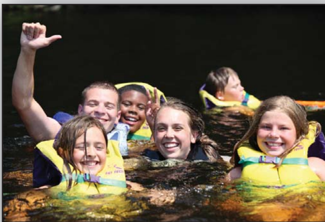
Campers and counselors enjoy a cool dip in the river during water activities at the Michigan National Guard Youth Leadership Camp at Alpena Combat Readiness Training Center, Alpena, Mich., July 22, 2014.

The Michigan Army National Guard G1 continues to manage one the few remaining Joint, Interagency, and Interdepartmental elements within the Michigan National Guard structure. During 2014 the Family Programs Office completed a yearlong accreditation process