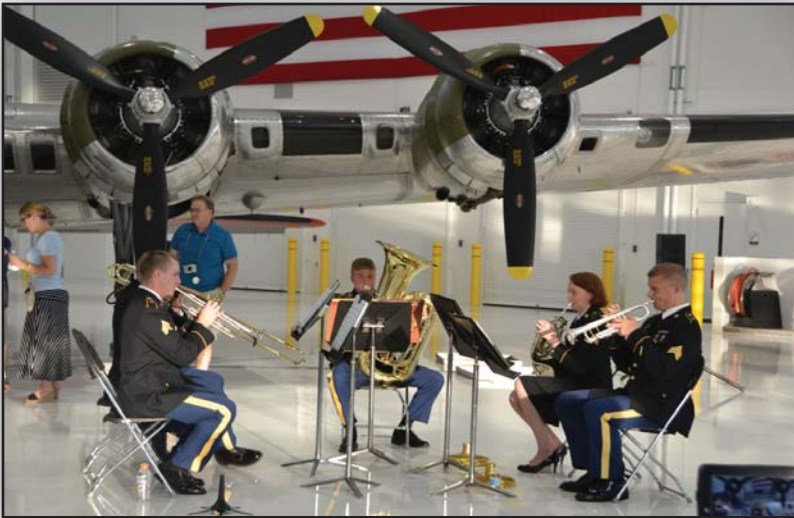
Horns from the 126th Army Band play during an Honor Flight event in Grand Rapids on June 24, 2014.

also led to the process of beginning a one-third lifecycle of computer systems that were three to five years old bringing the MIARNG up to date with today's technology. The ISSB transitioned helpdesk systems resulting in an approximated $50,000 cost savings.