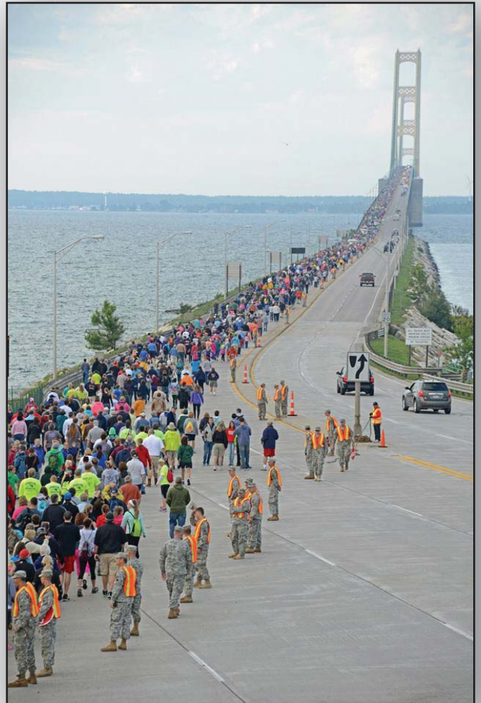
Soldiers of the Michigan National Guard's 63rd Troop Command, to include the 126th Cavalry Regiment, the 237th Brigade Support Battalion, and the Brigade Special Troops Battalion, 37th Brigade Combat Team, provided assistance during the 57th Annual Mackinac Bridge Walk, Sept. 1, 2014. More than 200 Soldiers functioned as road guards and provided security during the Labor Day event in which approximately 30,000 people walked five miles from St. Ignace across the Mackinac Bridge to Mackinaw City.

In August of 2014, the 1437th Engineer Company con-