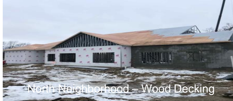
North Neighborhood – Wood Decking