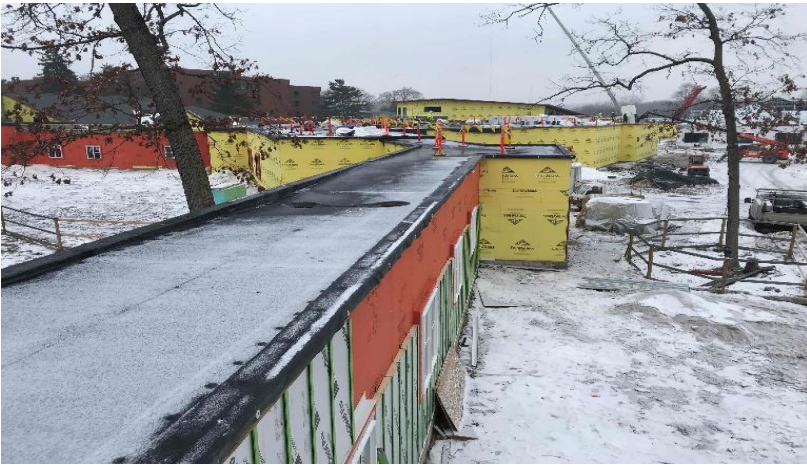
East Connector – 1/31/20