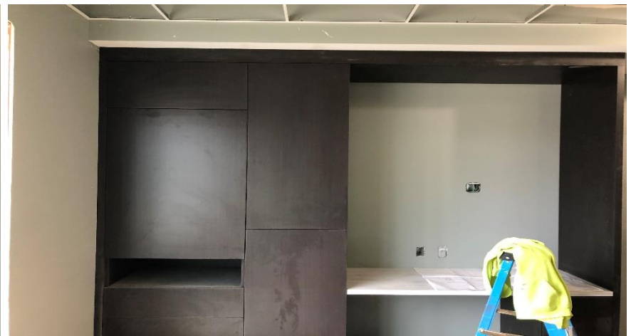
Resident Mockup Desk/Wardrobe - 1/29/2020