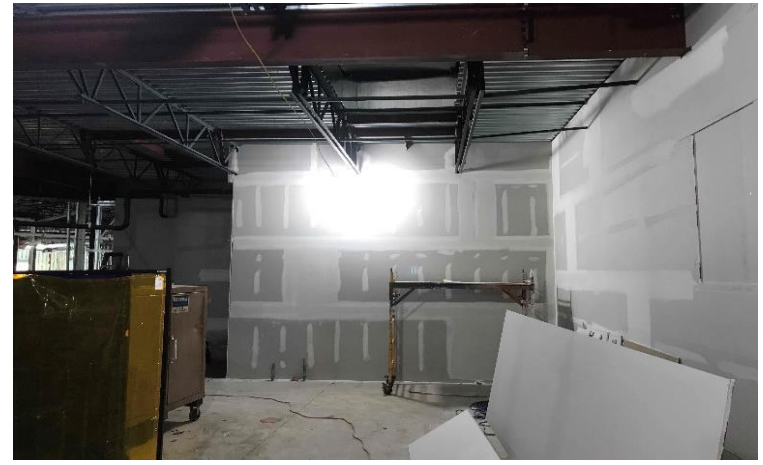
CC Interior Framing -1/31/20