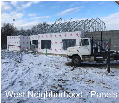
West Neighborhood - Panels