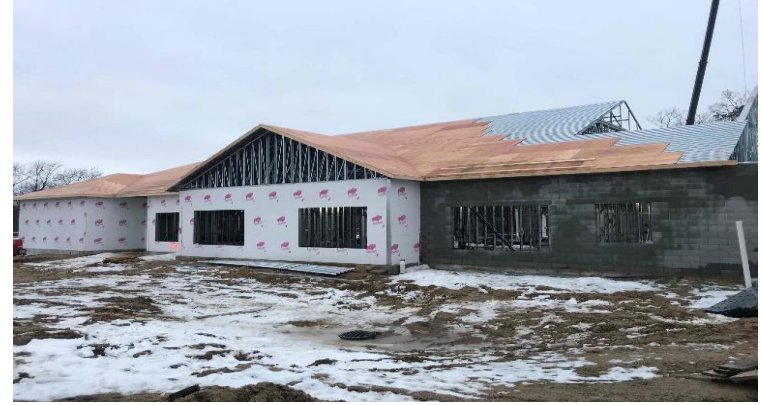
Metal/Wood Decking NN – 1/31/20