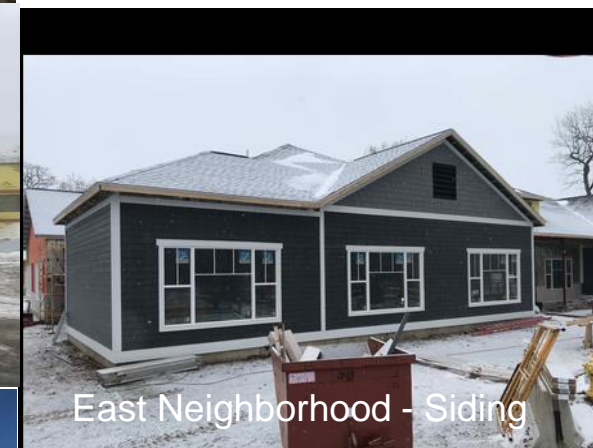
East Neighborhood - Siding