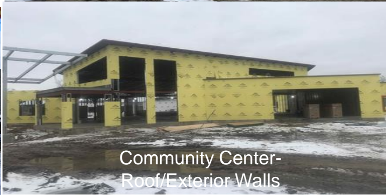
Community Center- Roof/Exterior Walls