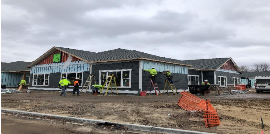
Exterior Siding NE - 1/29/2020