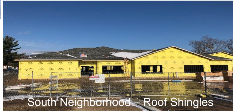
South Neighborhood – Roof Shingles