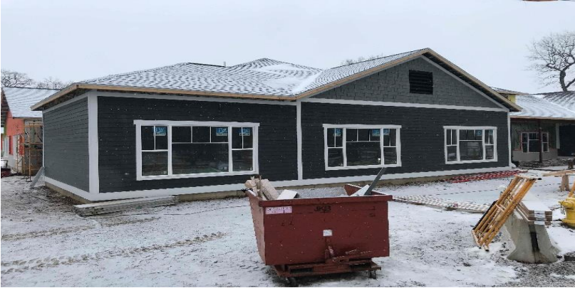
Exterior Insulation EN – 1/24/20