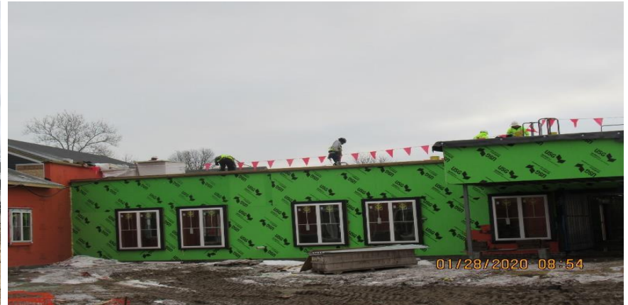
NW-SW Connector - 1/28/2020