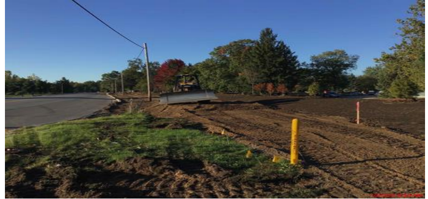
Sidewalk Prep along Sugarbush – 10/08/2020