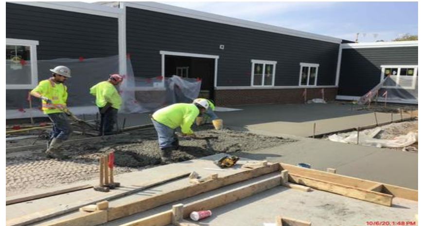
Site Sidewalks – 10/6/2020