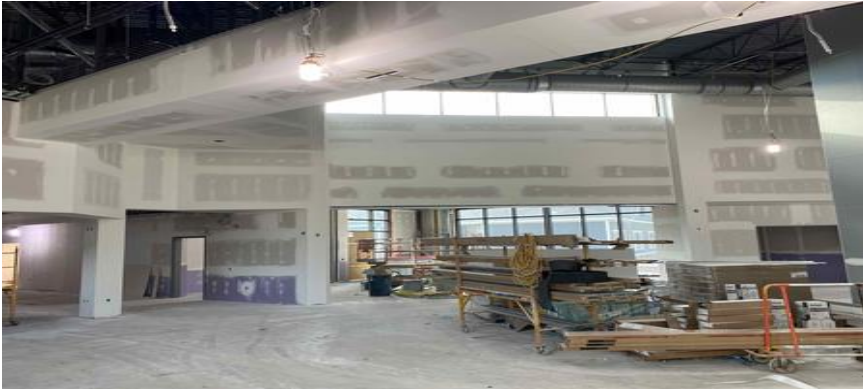
Drywall CC Main Lobby -10/16/20