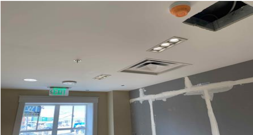
Fire Alarm/Exit Sign Install – 10/16/20