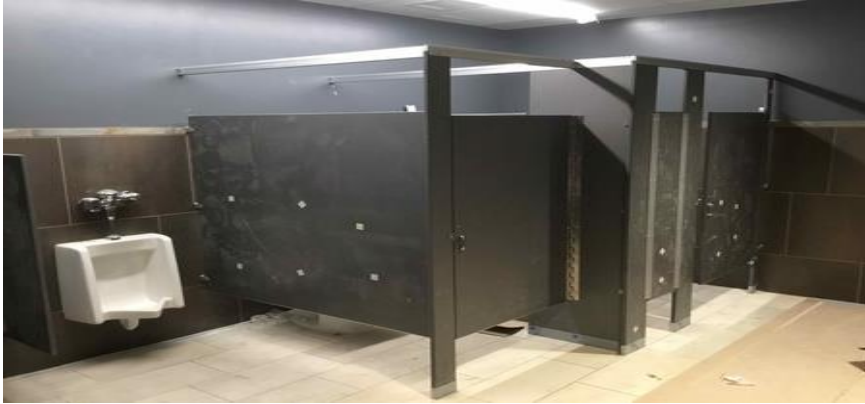
CC Public Bathroom – 10/7/2020