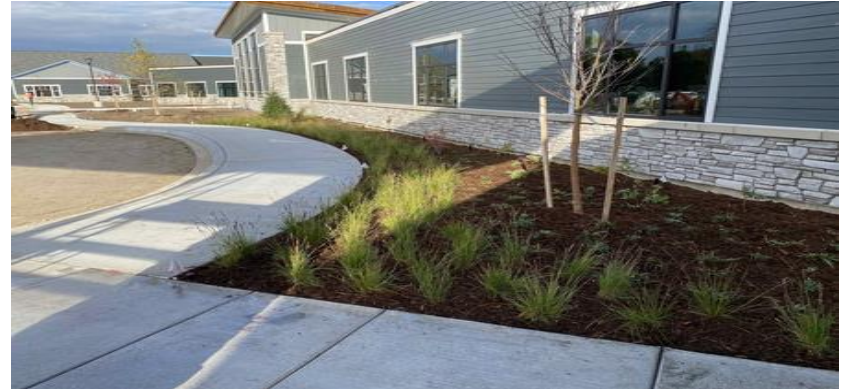
Landscaping – 10/16/20