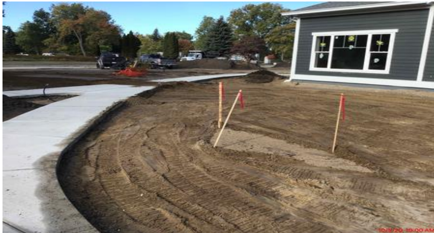
Landscaping – 10/5/2020