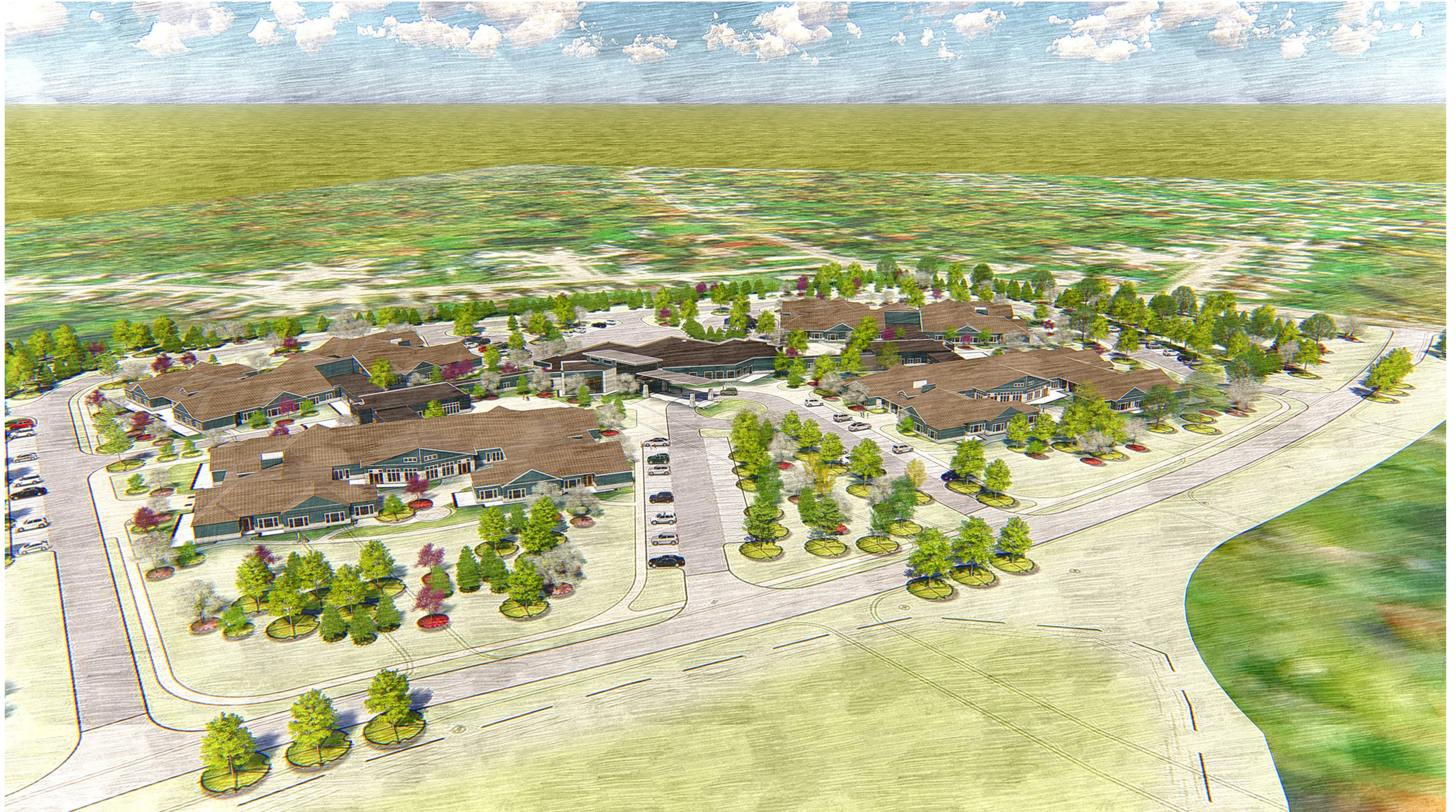
SITE AERIAL FROM SOUTH LOOKING NORTHEAST