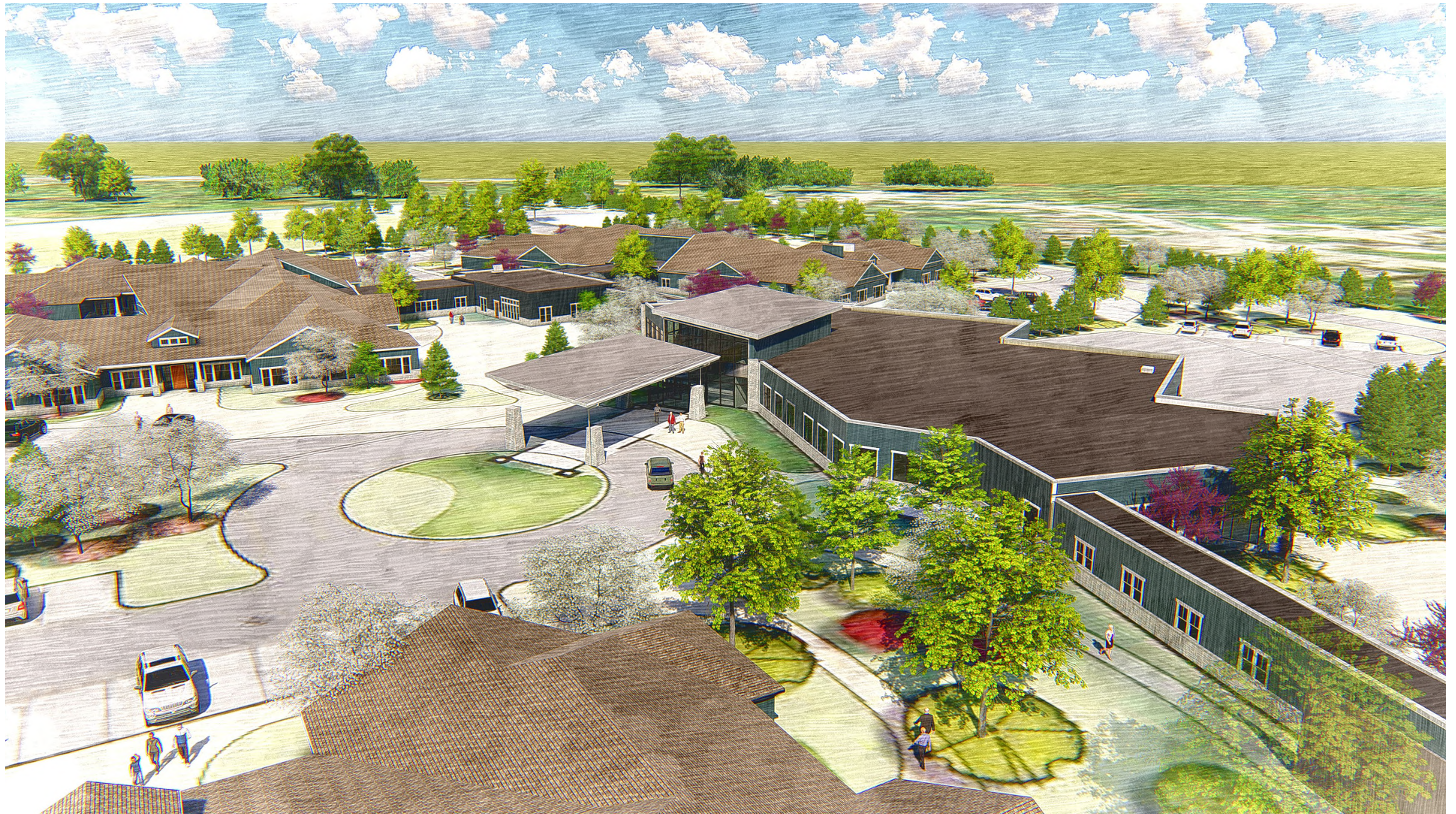
COMMUNITY CENTER SOUTH AERIAL LOOKING NORTHWEST