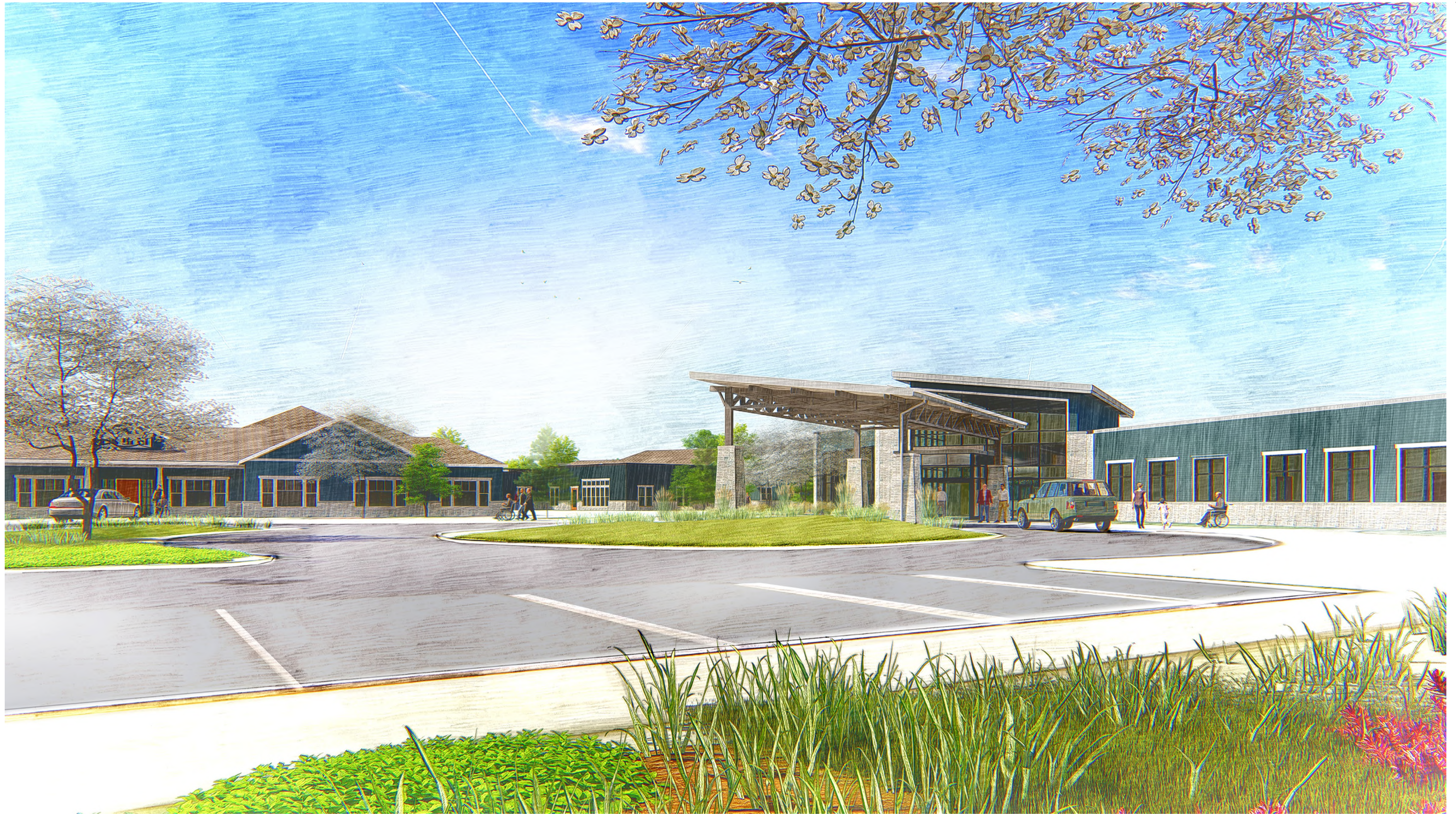
COMMUNITY CENTER FROM SOUTH ENTRY DRIVE LOOKING NORTHWEST