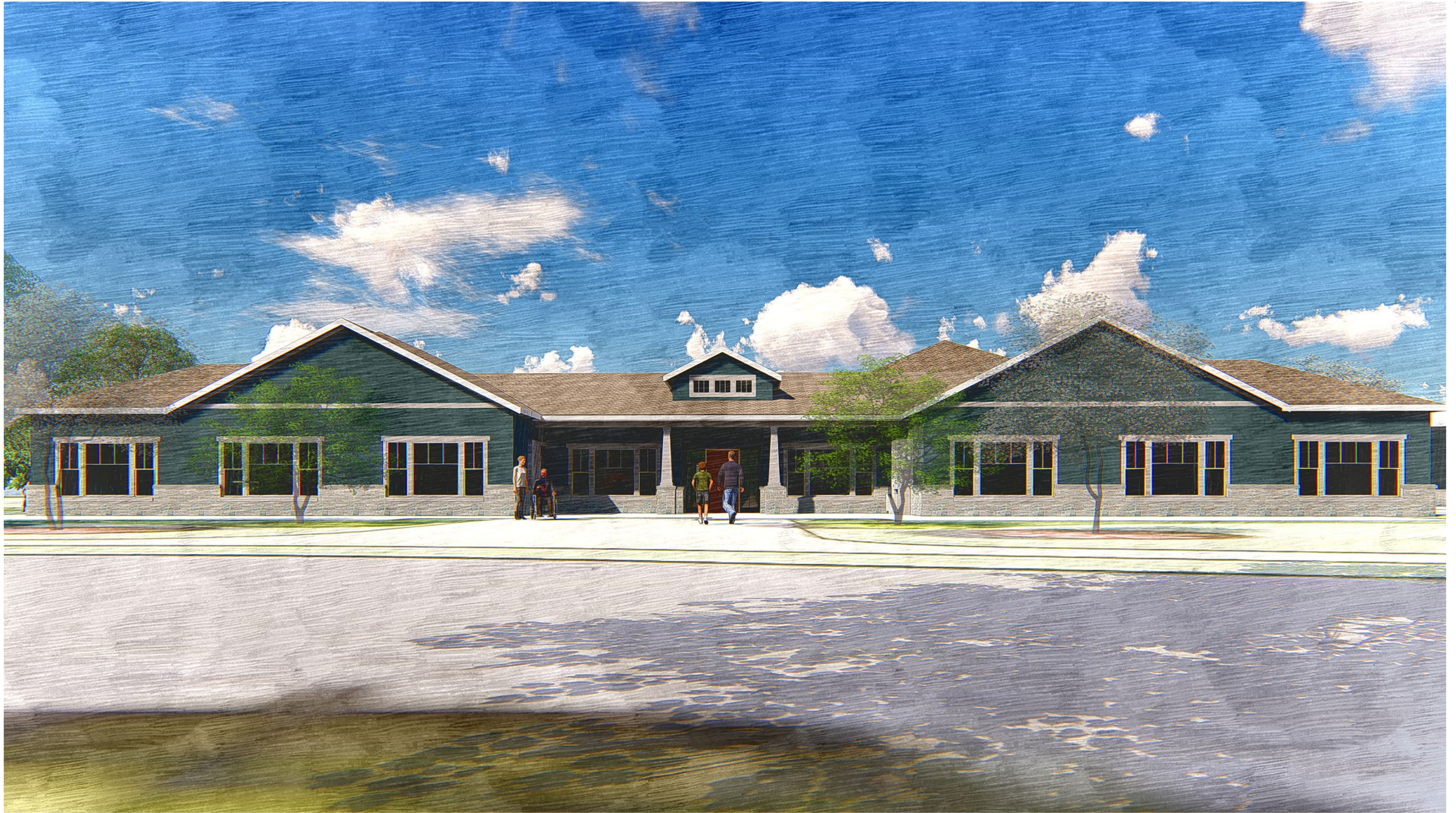
NEIGHBORHOOD VIEW OF FRONT ENTRANCE