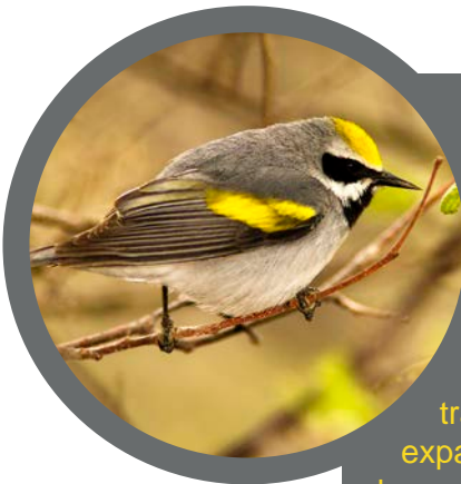
Golden-winged Warbler (Vermivora chrysoptera) Special Concern

Where we are now and what we think we can realistically achieve over the next 10 years.