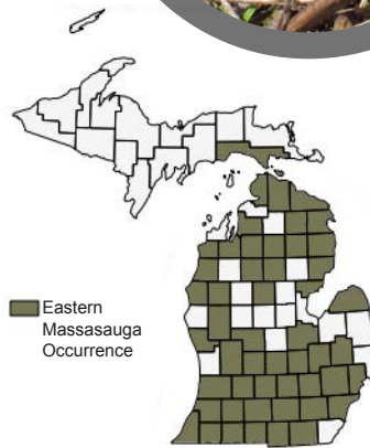
■ Eastern Massasauga Occurrence

Eastern Massasauga is Michigan's only rattlesnake, and is a shy docile snake that prefers to remain hidden. When threatened, they will sound their rattle and try to escape, preferring to avoid confrontations. Hedgecock (1992) found that the only thing that elicited a striking response from a Massasauga was being stepped on, and that was only 7% of the time. This snake offers little threat to reasonably careful people willing to leave them alone. Eastern Massasaugas in northern Michigan are most often associated with lowland coniferous forests, open wetlands, prairies, savannas, barrens, and forest openings. Structural characteristics appear to be more important than vegetative composition; important habitat characteristics include open, sunny areas intermixed with shaded areas, hibernation areas with the water table near the surface, and juxtaposition of wetland and upland areas for use during different times of year (Lee and Legge 2000). Michigan is the last stronghold for this snake in the United States, which is listed as endangered in every other state and province in which it occurs. The species has likely declined by 30% over the last 30 years, although it appears to be somewhat stable in the southwest and northern portions of its range in Michigan. According to the state's Natural Heritage Database there are 127 potentially viable element occurrences in Michigan.