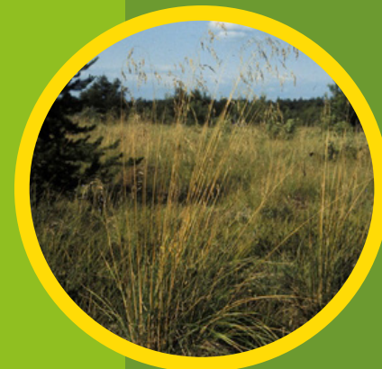
Rough fescue ( Festuca altaica )