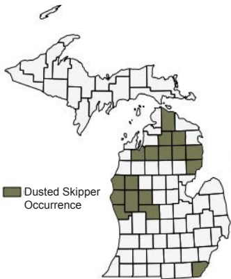
■ Dusted Skipper Occurrence