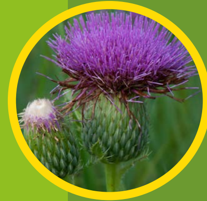
Hill's thistle ( Cirsium hillii )