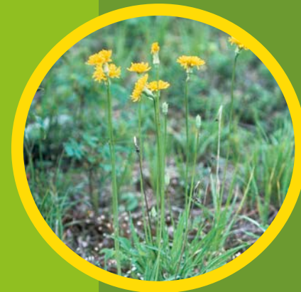
Prairie agoseris ( Agoseris glauca )