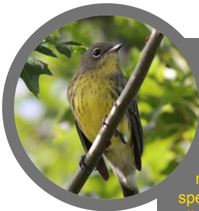
Kirtland's Warbler (Dendroica kirtlandii) Federally and State Endangered

Where we are now and what we think we can realistically achieve over the next 10 years.