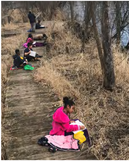
Students explore the forest.

Wheels to Woods, a program that connects kids with forests, served 3,168 people at a cost of $8,643, or $3.07 per student.