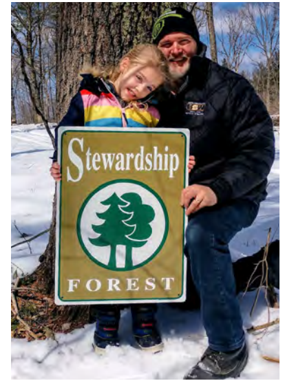
Starting a stewardship tradition.

A total of 243 volunteers reported cleaning more than 80,640 acres of public land in 2020 through the Adopt-A-Forest campaign. They removed 899 cubic yards of trash, including 1,763 scrap tires. More than half of the cleanups occurred between June 15 and Sept. 22 during a "100 Cleanups in 100 Days" campaign. Volunteers cleaned over 150 illegal dumpsites to commemorate 100 years of the National Association of State Foresters.