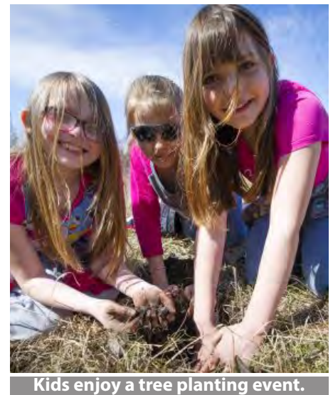
Kids enjoy a tree planting event.

North Central Michigan College joined eight other colleges certified as a Tree Campus USA. ITC Michigan and Spectrum Healthcare-Blodgett Hospital recertified as the state's only representatives for their respective programs, Tree Line USA and Tree Campus-Healthcare.