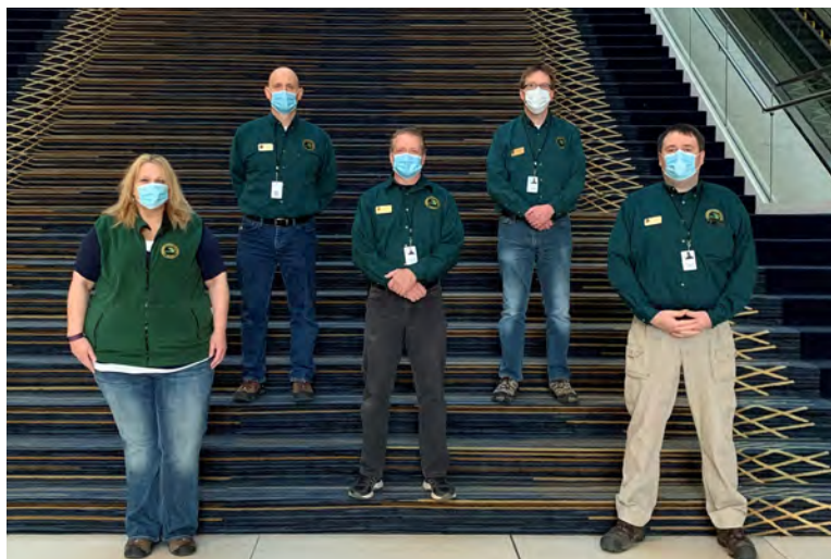
An incident management team assisting at Detroit TCF Center.

Prescribed burns were put on hold for the year but returned in spring 2021 with highly trained DNR firefighters using fire to help control invasive species, create fuel breaks to prevent large wildfires and improve habitat for wildlife.