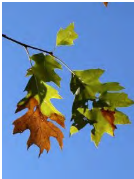
Oak leaves from a diseased tree.

Oak wilt is widespread in the southern Lower Peninsula, with spotty distribution in the northern Lower Peninsula. In the western Upper Peninsula, oak wilt is common along the border with Wisconsin from Iron County south. See the interactive online oak wilt map for confirmed and suspected locations.