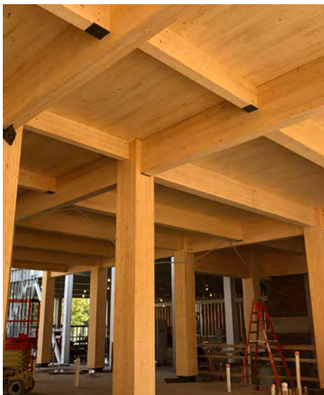
MSU's new mass timber STEM facility.

The DNR plans to build a $5 million Upper Peninsula field office and customer service center in Newberry to showcase this sustainable way of building; it's in the design stages now.