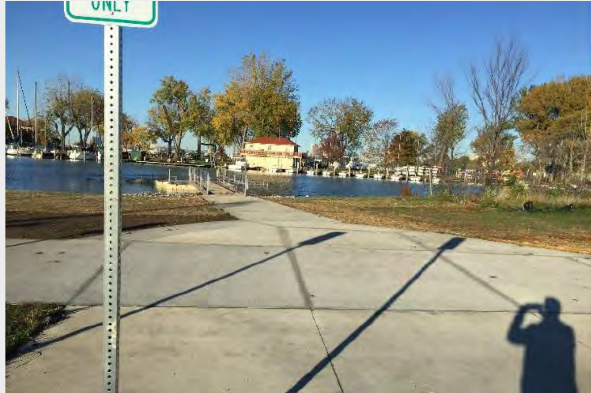
Launch at Northshore fishing area

Belle Isle Park Infrastructure Update, October 2020