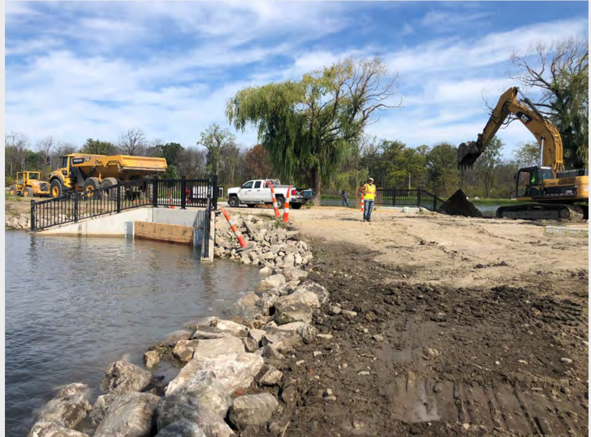
Stop log structure is in and final shoreline grading is underway

Belle Isle Park Infrastructure Update, October 2020