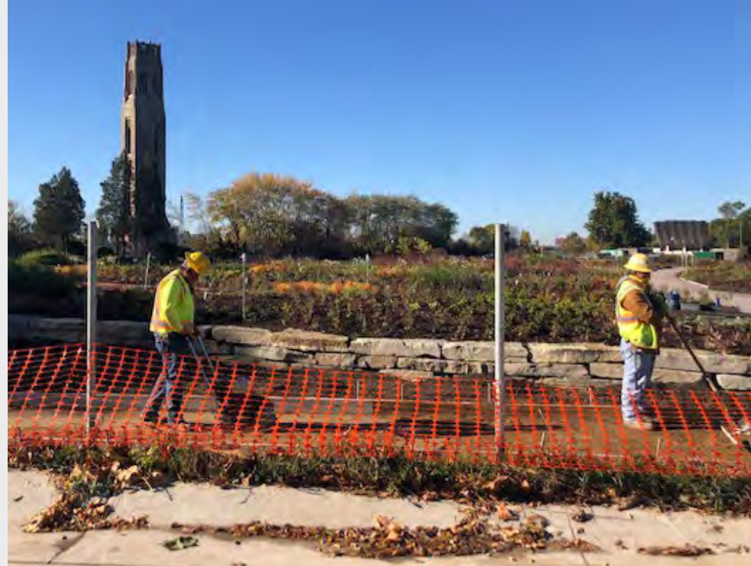
Raised beds for Oudolf Garden

Belle Isle Park Infrastructure Update, October 2020