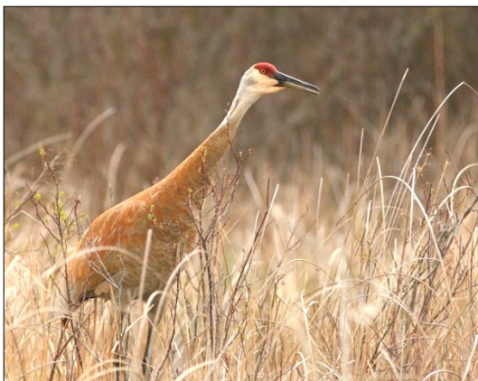
Cranes roost at night in area marshes including Haehnle Sanctuary where up to 8,000 may be seen in October and November.