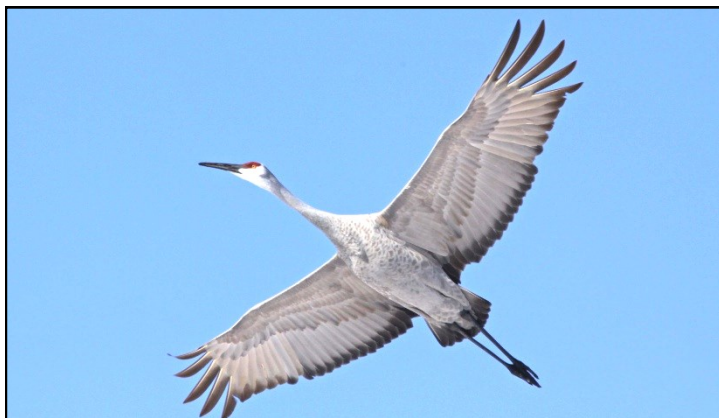
The Crane above flies with its neck out stretched in typical crane fashion. Great blue heron fly with their necks in an S curve and their heads resting on their shoulders.