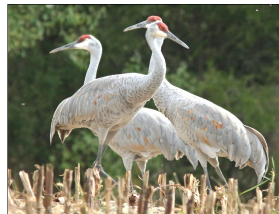
Cranes appear brown most of the year, but turn gray when they molt in the fall. The brown color is acquired by preening in the marsh waters.

Late in the summer, Sandhills abandon their nesting territories and flock to staging areas like the Haehnle Sanctuary. Staging areas typically provide abundant food, protected night roosting sites and the benefits of congregating in flocks during migration. Here the routes and traditions of older, experienced birds can be passed on to less experienced individuals.