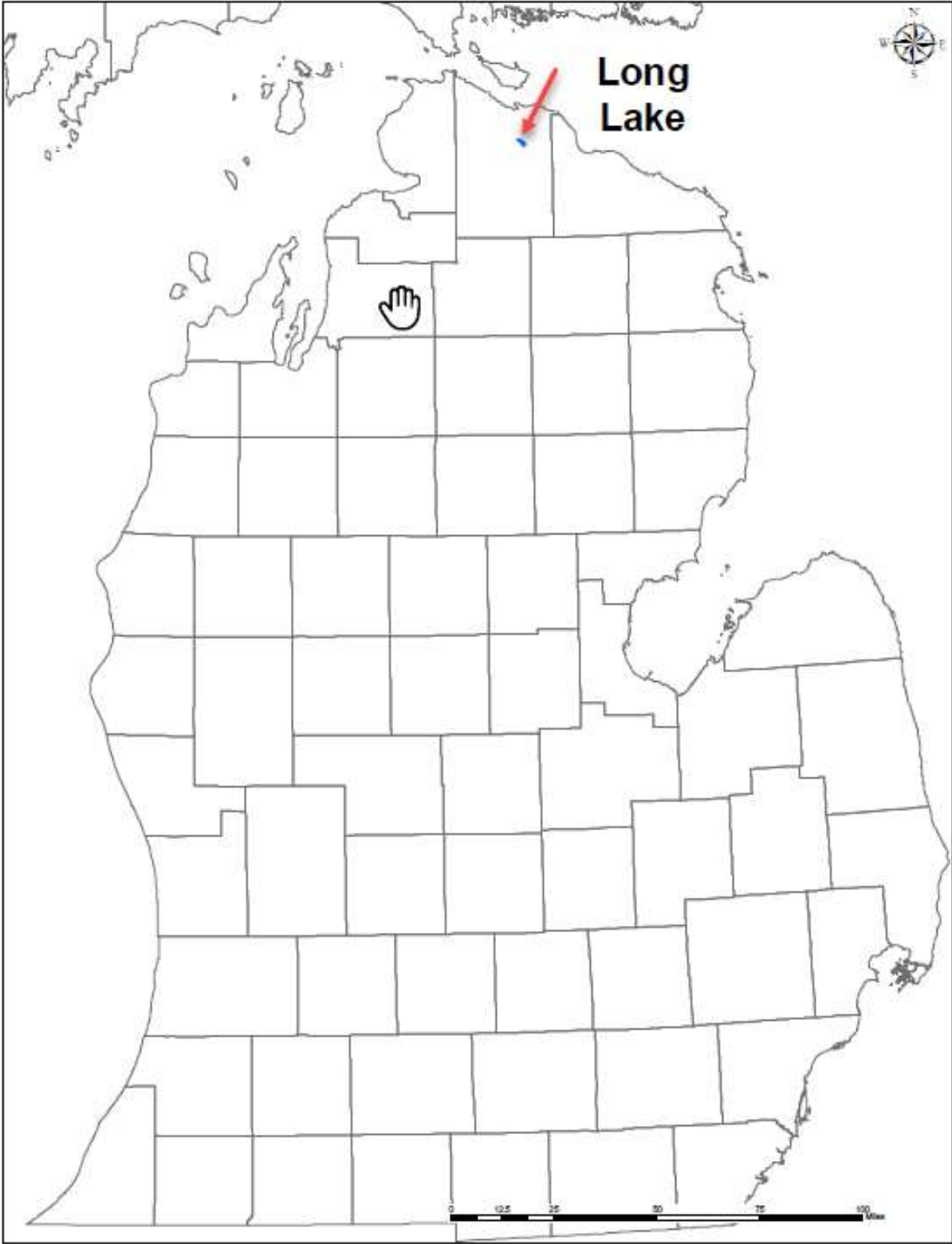
Figure 1. General location of Long Lake, Cheboygan County in the northern Lower Peninsula of Michigan.