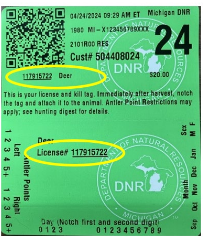
Figure 1. Deer Harvester Tag showing Kill Tag License Number (circled) to be used on submission form.