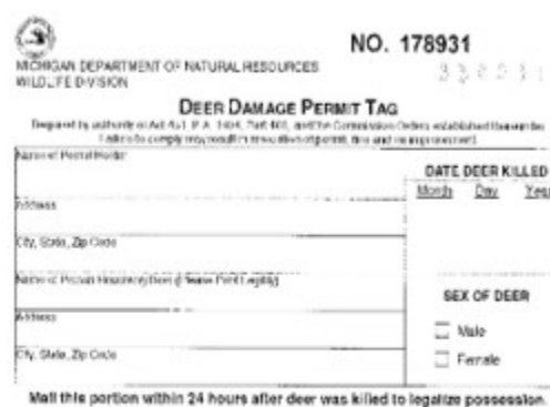
Figure 2. Deer Damage Permit Tag showing (circled) Kill Tag ID number to be used on submission form.