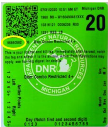
Figure 1. Deer Harvester Tag showing (circled) Kill Tag ID number to be used on submission form.