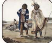
Drawing courtesy of Canadian Archives

Negwegon was a famous Chippewa Chief who lived in the Mackinaw area of Michigan's northern lower peninsula in the late 1700s.