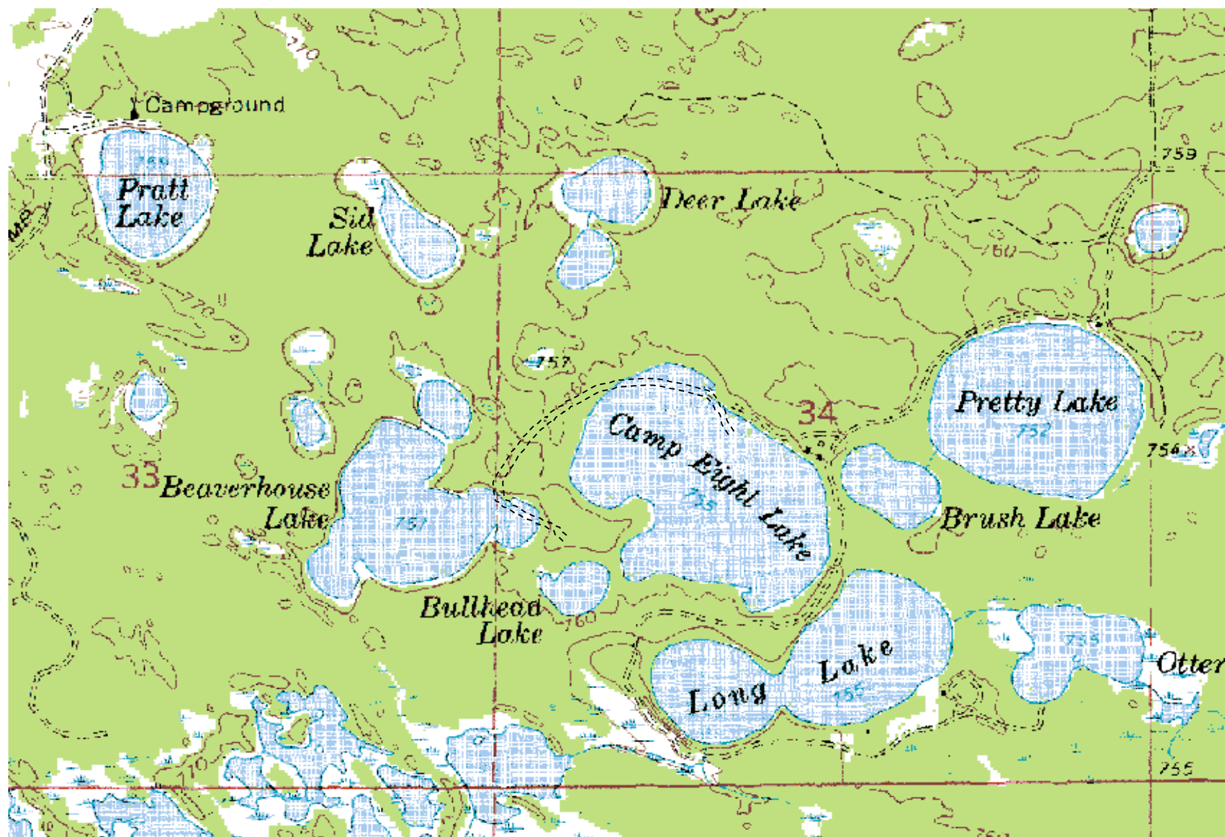
Figure 1.-Area map of Pretty Lakes Complex, Luce County.