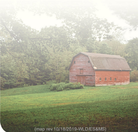
(map rev. 10/18/2019-WLD/ES&MS)

Includes deer harvested by USDA-Wildlife Services through MDARD's targeted surveillance and removal program on cattle farms.