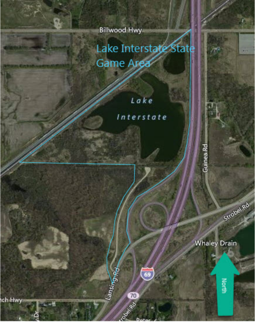
Figure 2. Lake Interstate State Game Area aerial photograph.