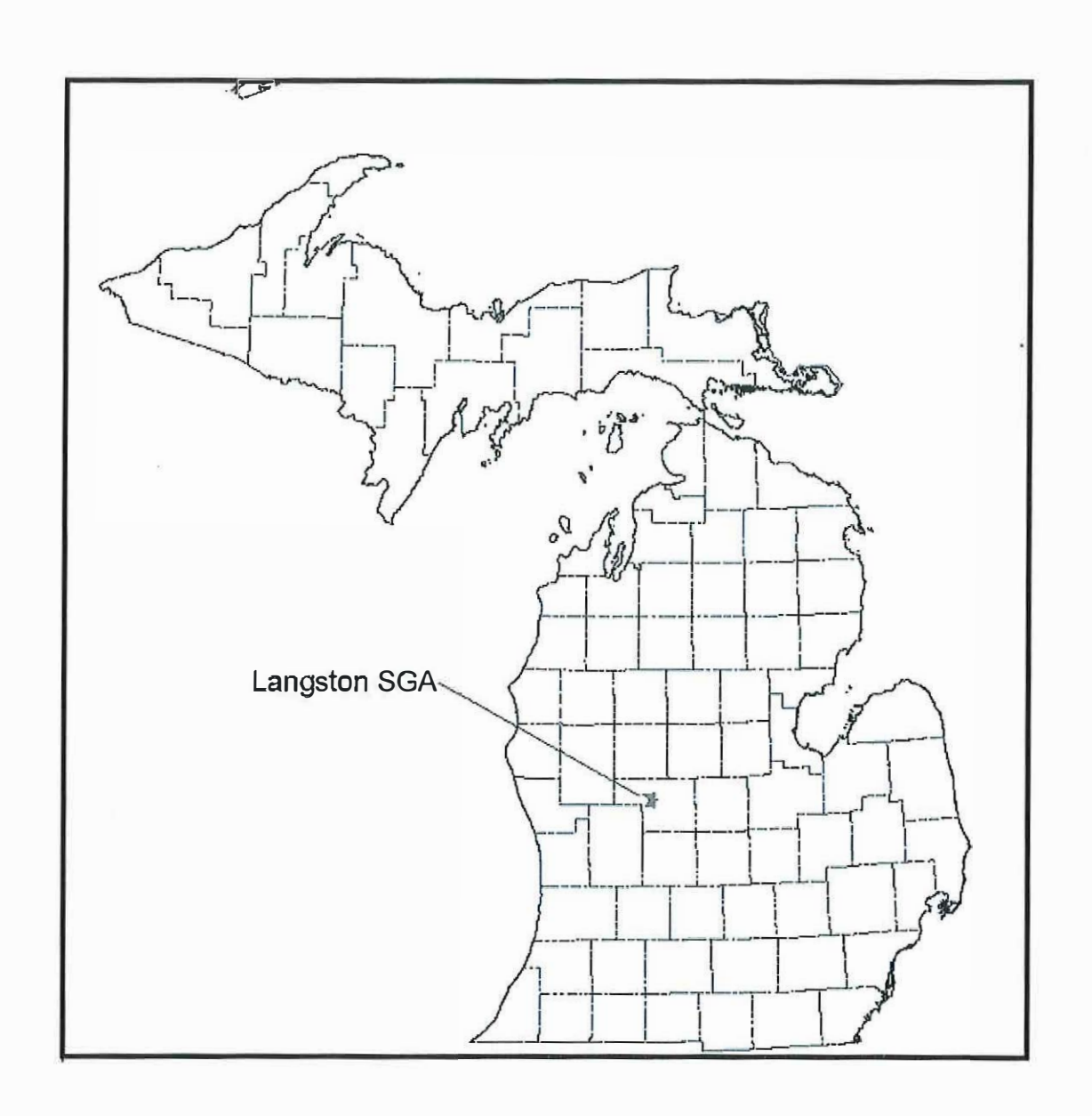
Figure 2. Location of the Langston SGA.