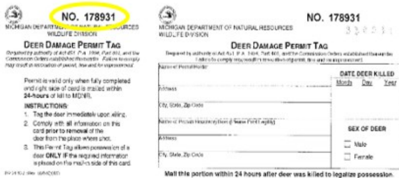
Figure 2. Deer Damage Permit Tag showing (circled) Kill Tag ID number to be used on submission form.