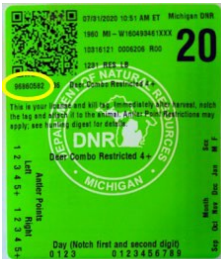
Figure 1. Deer Harvester Tag showing (circled) Kill Tag ID number to be used on submission form.