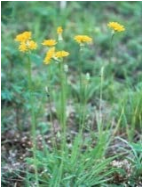
Prairie agoseris ( Agoseris glauca )