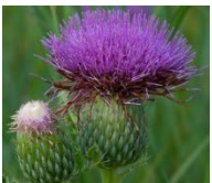
Hill's thistle ( Cirsium hillii )