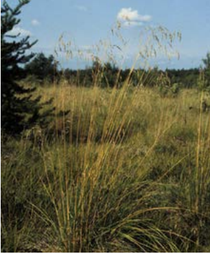
Rough fescue ( Festuca altaica )