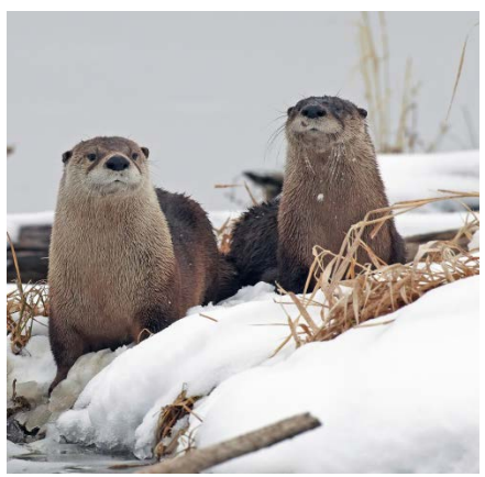
North American River Otter