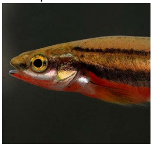
Southern Redbelly Dace