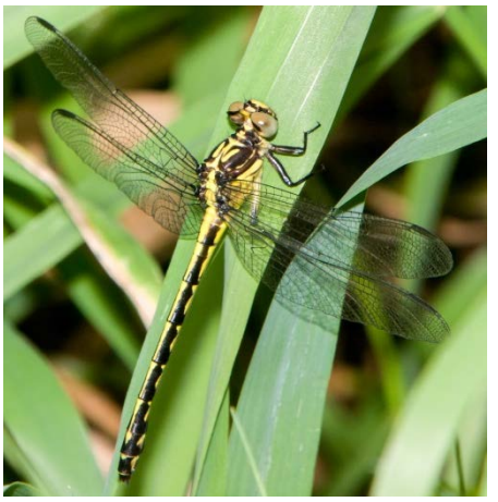
Riverine Clubtail Dragonfly