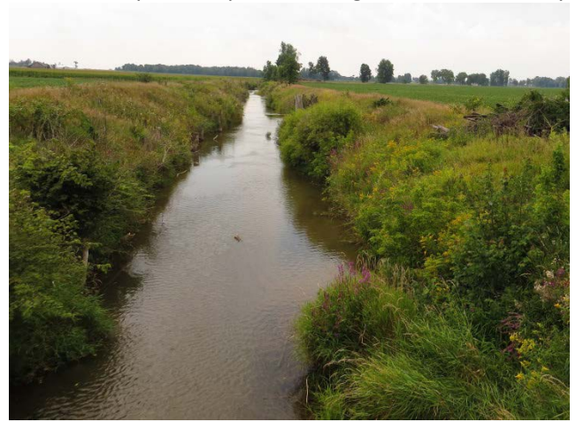
Threats to All Focal Species