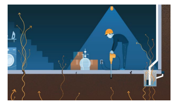
A drill is used to install a small sample port called a vapor pin to collect soil gas samples beneath your home over time.

It typically takes 1 to 2 hours to collect each sample and is often done at the same time as an indoor air sample.