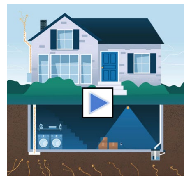
A vapor intrusion mitigation system removing soil vapors preventing them from entering the home.

Visit Michigan.gov/VaporIntrusion or contact EGLE at 800-662-9278 for technical and general questions about vapor intrusion. Contact the MDHHS at 800-648-6942 for health-related, chemical exposure questions.