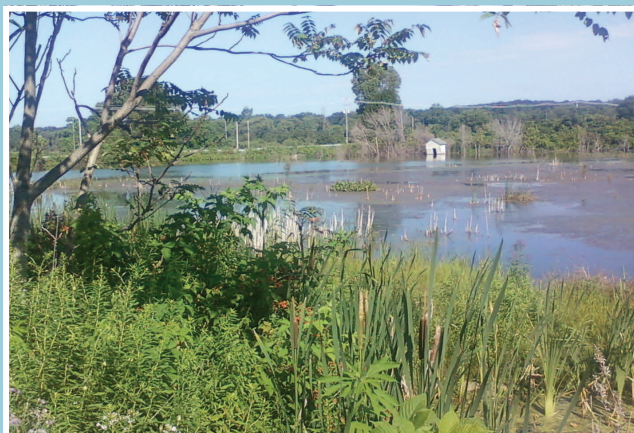
Former celery farm — proposed area for wetland restoration. Picture is facing north.