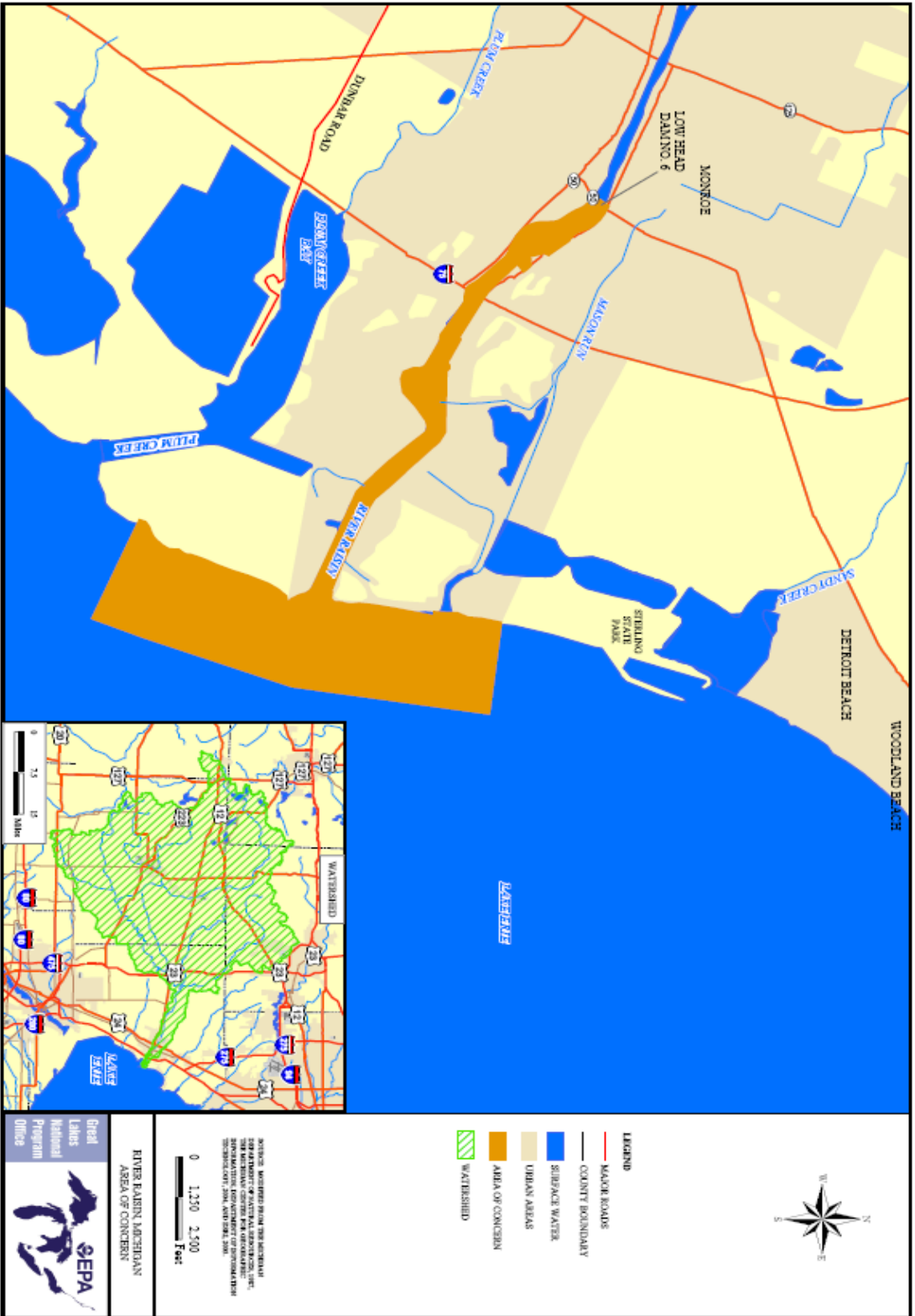
Figure 1. The River Raisin Area of Concern.