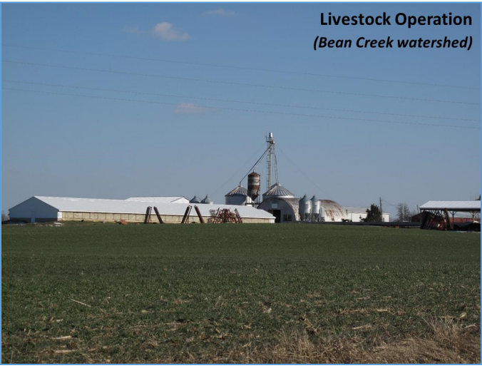
Livestock Operation (Bean Creek watershed)