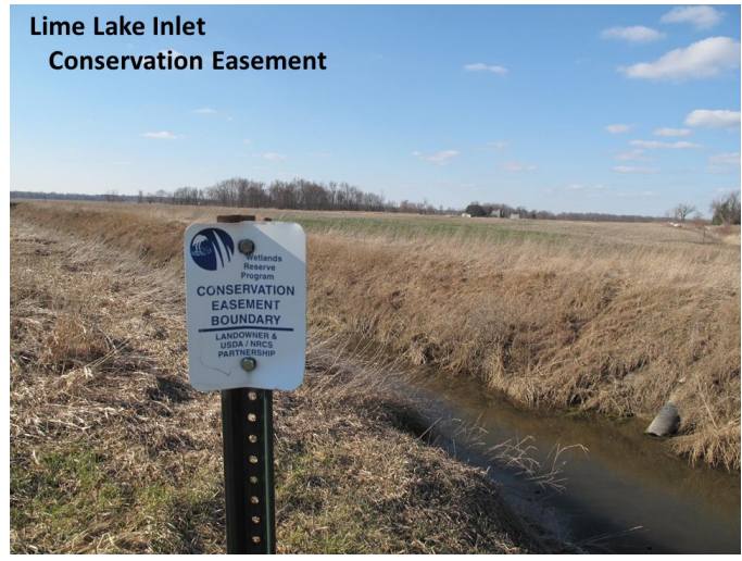
Lime Lake Inlet Conservation Easement