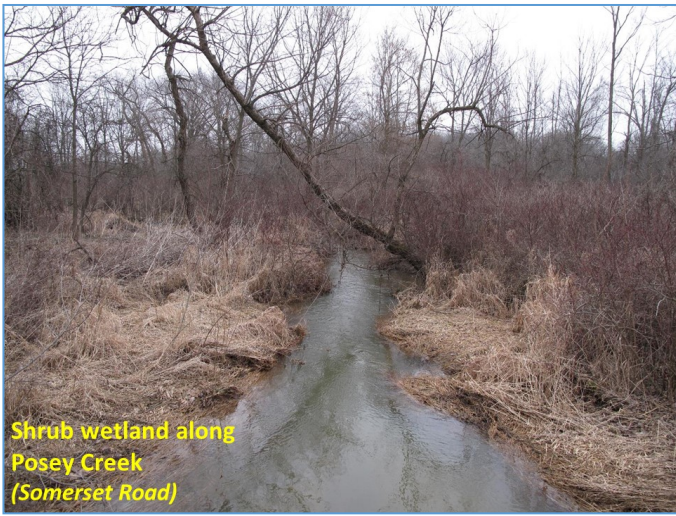
Shrub wetland along Posey Creek (Somerset Road)