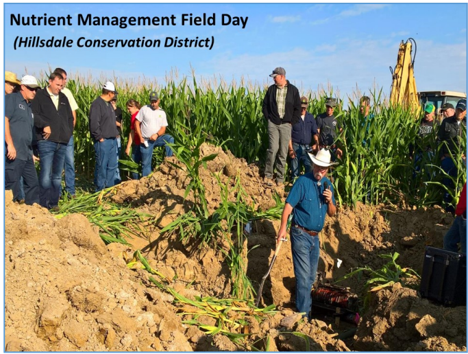
Nutrient Management Field Day (Hillsdale Conservation District)