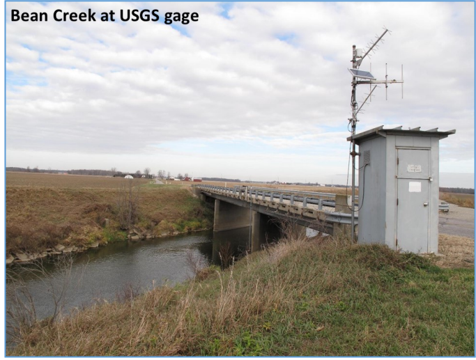
Bean Creek at USGS gage