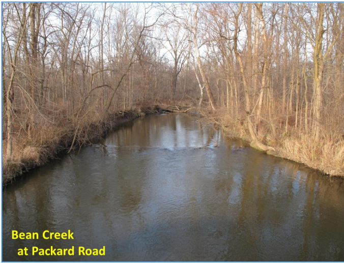
Bean Creek at Packard Road