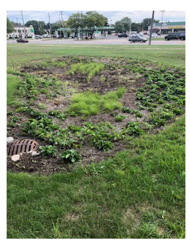
After the installation of two rain gardens, M-TEC no longer has standing water and drainage issues on its property.