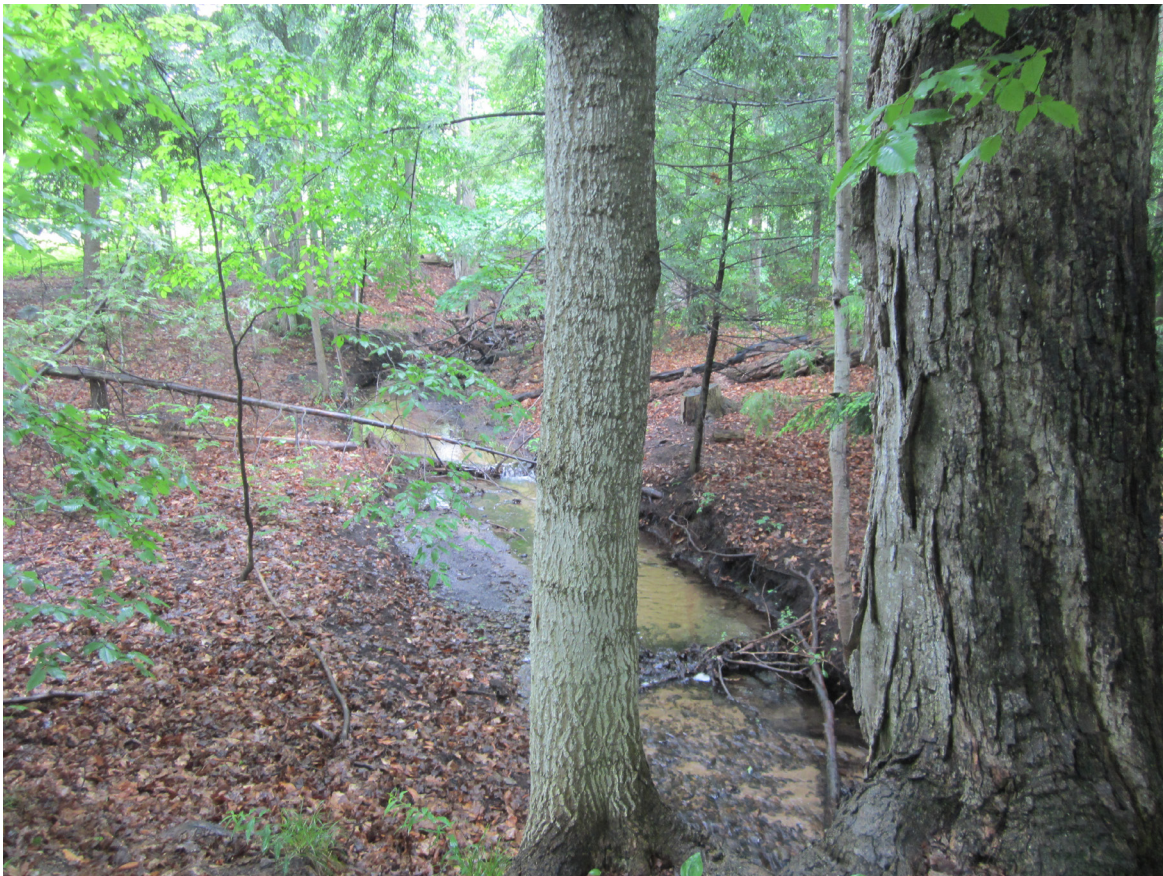
Swan Permanent Conservation Easement: Protects over 2,200 feet along both banks of Brewery Creek, which eventually flows directly into West Grand Traverse Bay.