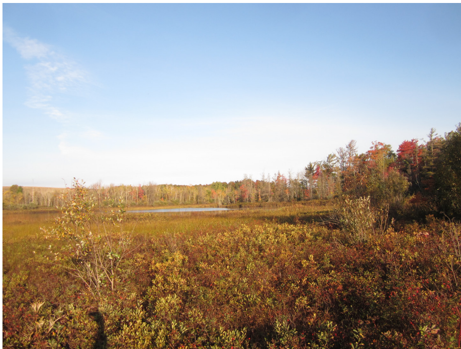
Kalchik Permanent Conservation Easement: Protects over 1,040 feet of Bass Lake shoreline with 17 acres of riparian wetlands including leatherleaf, emergent, submergent and rich conifer wetland communities.