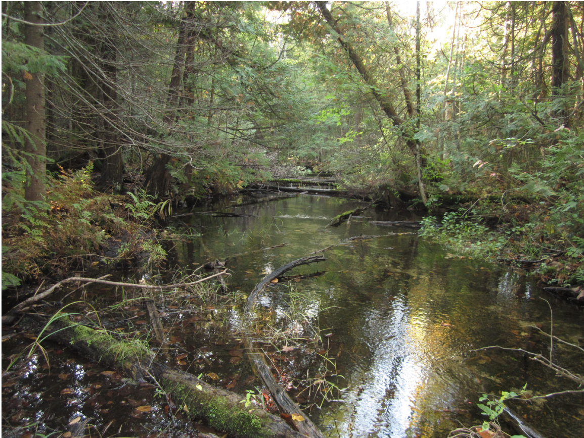
Kalchik Permanent Conservation Easement: Protects over 1,015 feet along both banks of Belangers Creek.