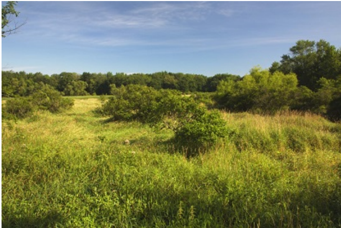
Brown Sanctuary Conservation Easement: Permanently protects 280 acres of mature oak ravine forest, upland prairie and Great Lakes marsh habitat, with 3 miles of frontage along the Paw Paw River and Blue Creek.