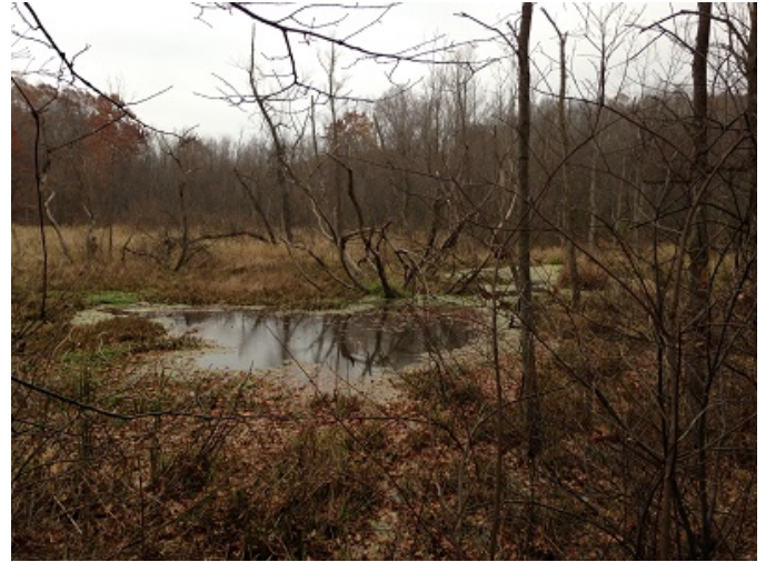
Blue Creek North Conservation Easement: 81 acres with over a mile of frontage along Blue Creek with a mix of upland fringe forest, old field, scrub-shrub, floodplain forest, and emergent wetlands.