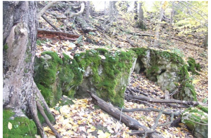
Nelson East Conservation Easement: Protects 72 acres with nearly 1 mile of frontage on the Paw Paw River, 18 acres of high-functioning wetlands with southern floodplain forest, and oak-hemlock riparian bluffs.