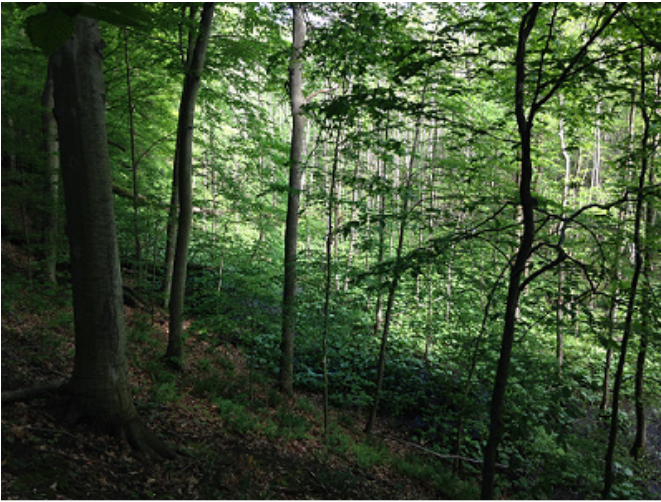
Black's Woods Conservation Easement: This 35-acre easement permanently protects property owned by Sarett Nature Center. It has 3,400 feet of frontage on the Paw Paw River, and consists of a combination of wooded upland forest and critical forested floodplain.