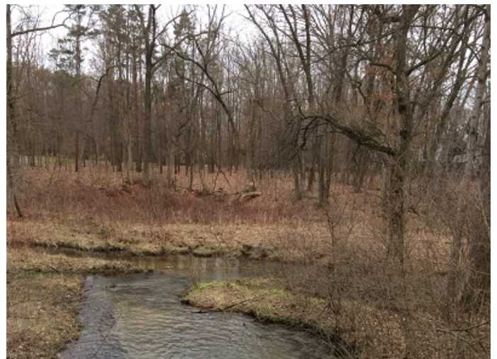
Tamarack Springs Conservation Easement: Protects 26 acres of upland and wetlands, including frontage along the East Branch of the Paw Paw River, 5 acres of wetlands, and mixed hardwood forest and savanna remnant with high-quality botanical species.