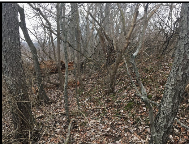
Siegrist Conservation Easement