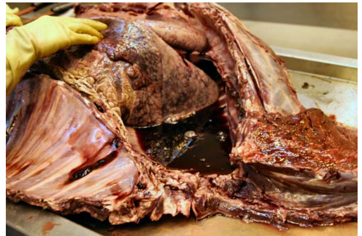
Blood-tinged fluid in the chest cavity