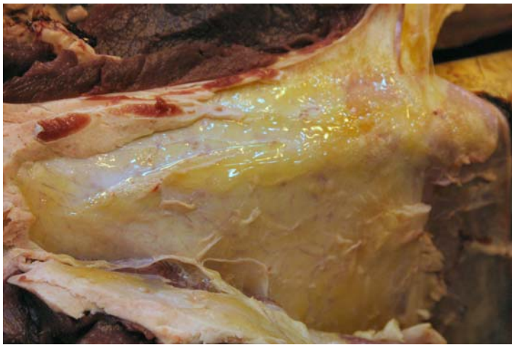
Edema (fluid) underneath the skin.