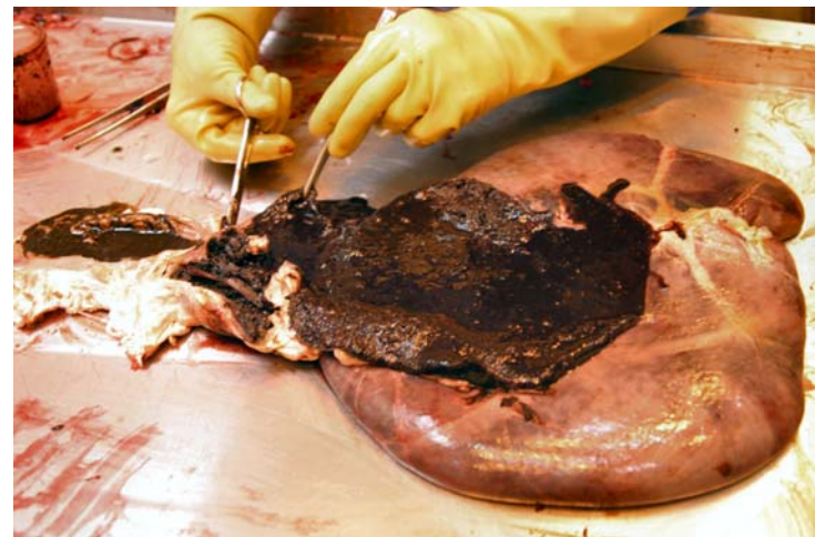
Blood-stained stomach contents