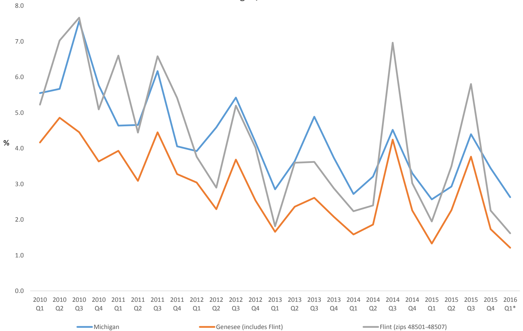
Incidence of elevated blood lead \geq 5 mcg/dL among children < 6 years of age by quarter, Michigan, 2010-2016

*Data for Quarter 1 of 2016 is subject to change.