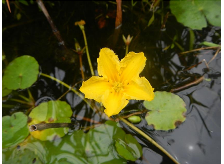
Michigan Department of Natural Resources