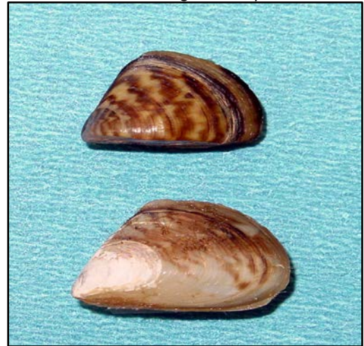
Dreissena polymorpha (top) Dreissena rostriformis bugensis (bottom)

Zebra and quagga mussels are both non-native freshwater mollusks found in all of the Great Lakes. The zebra mussel's striped shell pattern distinguish it from the quagga mussel. Quagga mussels have a rounded carina, or angle, between the ventral and dorsal surfaces and a convex ventral side (May and Marsden 1992). Contrarily, zebra mussels have a definite carina between the ventral and dorsal surfaces that are flattened on the ventral side (Claudi and Mackie 1994). If you placed both mussels on their ventral side, the quagga would topple over and the zebra would not (Claudi and Mackie 1994). Quaggas are generally rounder in shape and have a small byssal groove on the ventral side near the hinge. Zebra mussels are generally triangular and have a larger groove in the middle of the ventral side (Claudi and Mackie 1994, Marsden et al. 1996). Quagga mussels can develop a variety of shell patterns including black, cream, or white bands, while zebra mussels have dark striped shells or light shells with no stripes (Benson et al. 2014a, Benson et al. 2014b). In Lake Erie, a distinct quagga mussel morph can be found that is completely white (Marsden et al. 1996). Quagga mussels usually have dark concentric rings on their shell and lack color near the hinge. Reaching up to 50mm, Zebra mussels on average can be larger than quagga mussels that reach up to 40mm (Benson et al. 2014a, Benson et al. 2014b).