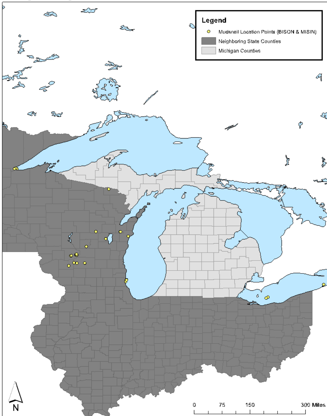
Figure 2. Unique coordinate location points which New Zealand mudsnails were detected in states surrounding Michigan. This data is according to the Biodiversity Information Serving Our Nation (BISON) and Midwest Invasive Species Information Network (MISIN) databases.