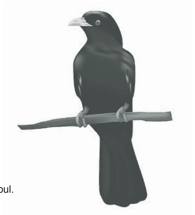
Image: Illustration of a black bird perched on a stick.