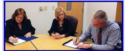
July 28 2015 Signing – From Left: