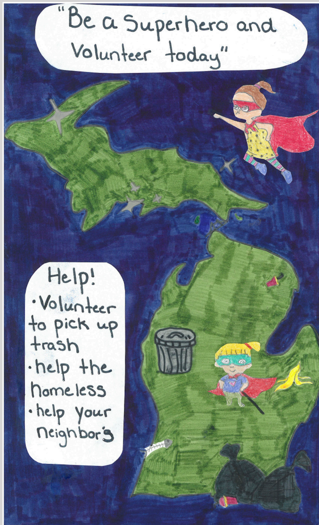
2018 Elementary winners: Gwen Chrysler and Kelsi Caporosso