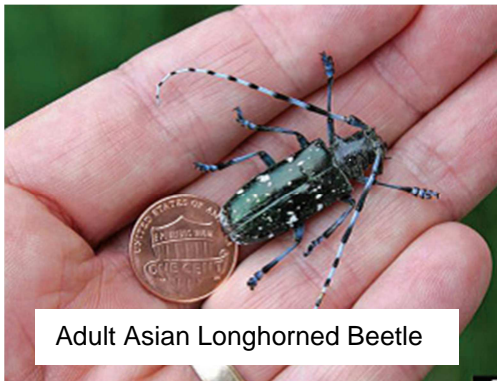
Adult Asian Longhorned Beetle

What can you do? Pay attention to trees, especially maples, with dying branches. Look for the characteristic exit holes in large branches or the trunks. Many websites have good ALB photos and information. If you see a suspect tree or beetle, take photos, record the location try to collect suspect beetles in a jar and report it.